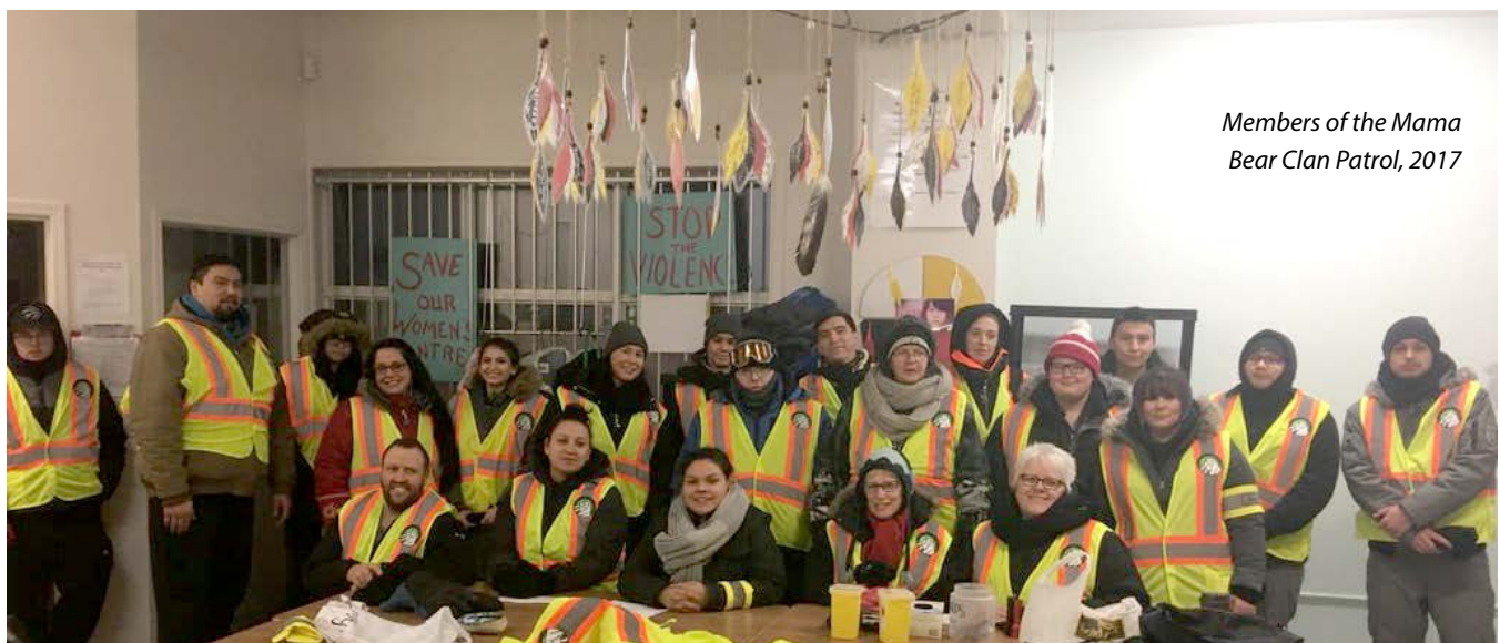
Members of the Mama Bear Clan Patrol, 2017

https://www.facebook.com/Mama-Bear-Clan-1699671170294271/