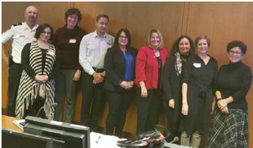
Members of the Winnipeg Safe City Initiative Steering Committee, from L to R:

The Steering Committee continues to meet on a regular basis to examine current priorities and policies, create partnerships, foster public awareness and strategize innovative solutions in ending sexual violence against women and girls. For more information please visit the Winnipeg Safe City website: http://winnipeg.ca/Clerks/boards/WpgSafeCity/default.stm and follow us on Twitter @WpgSafeCity. ■