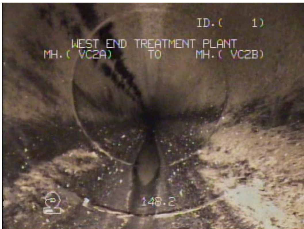
Video Capture 148.2 m from VC2A