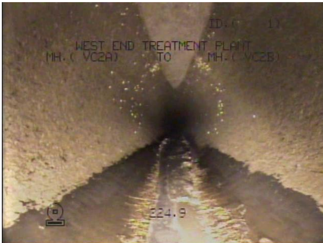
Video Capture 224.9 m from VC2A