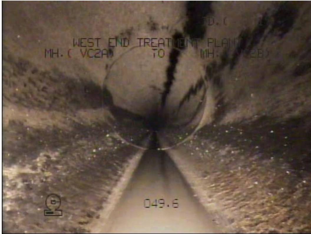
Video Capture 49.6 m from VC2A