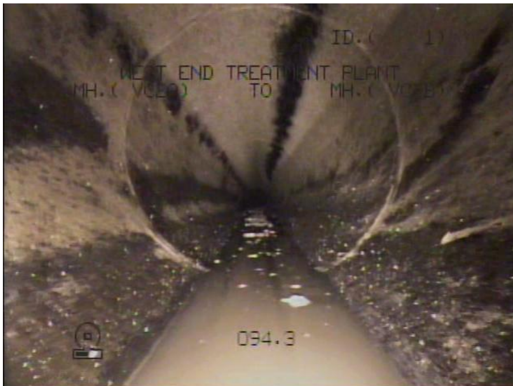
Video Capture 94.3 m from VC2A