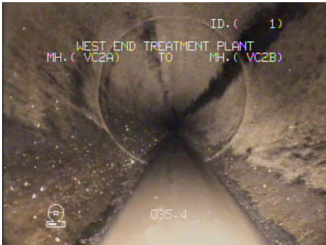
Video Capture 35.4 m from VC2A