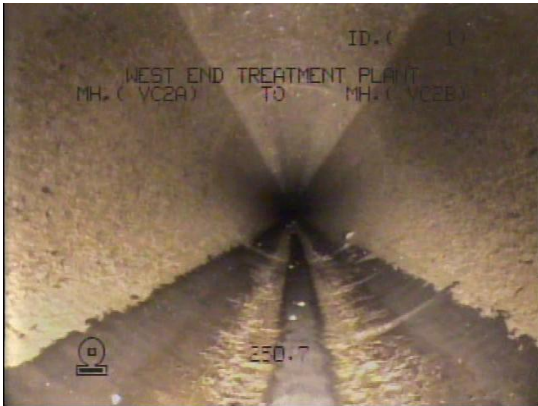
Video Capture 250.7 m from VC2A