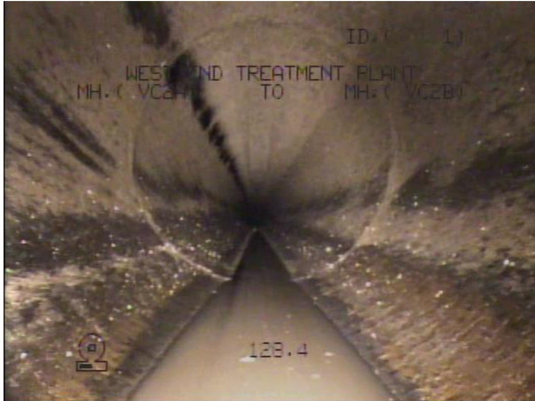
Video Capture 128.4 m from VC2A