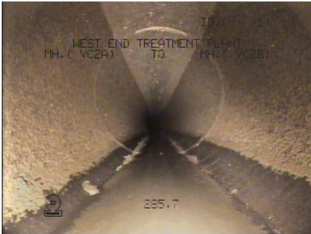
Video Capture 285.7 m from VC2A