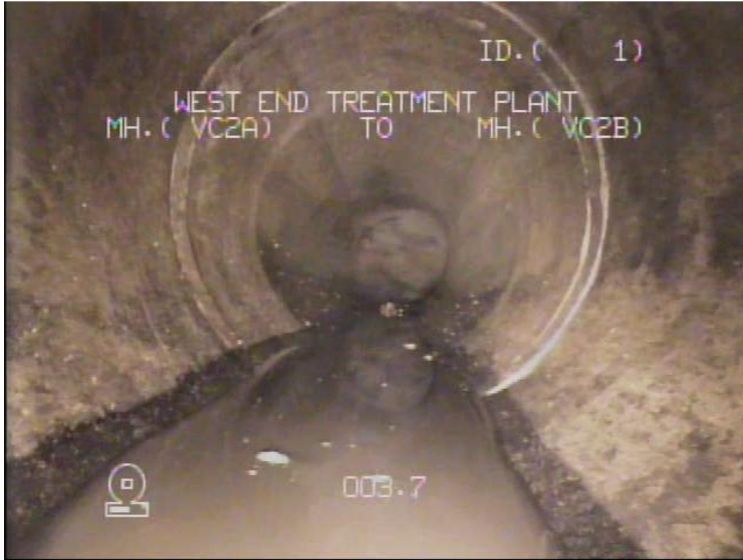
Video Capture 3.7 m from VC2A