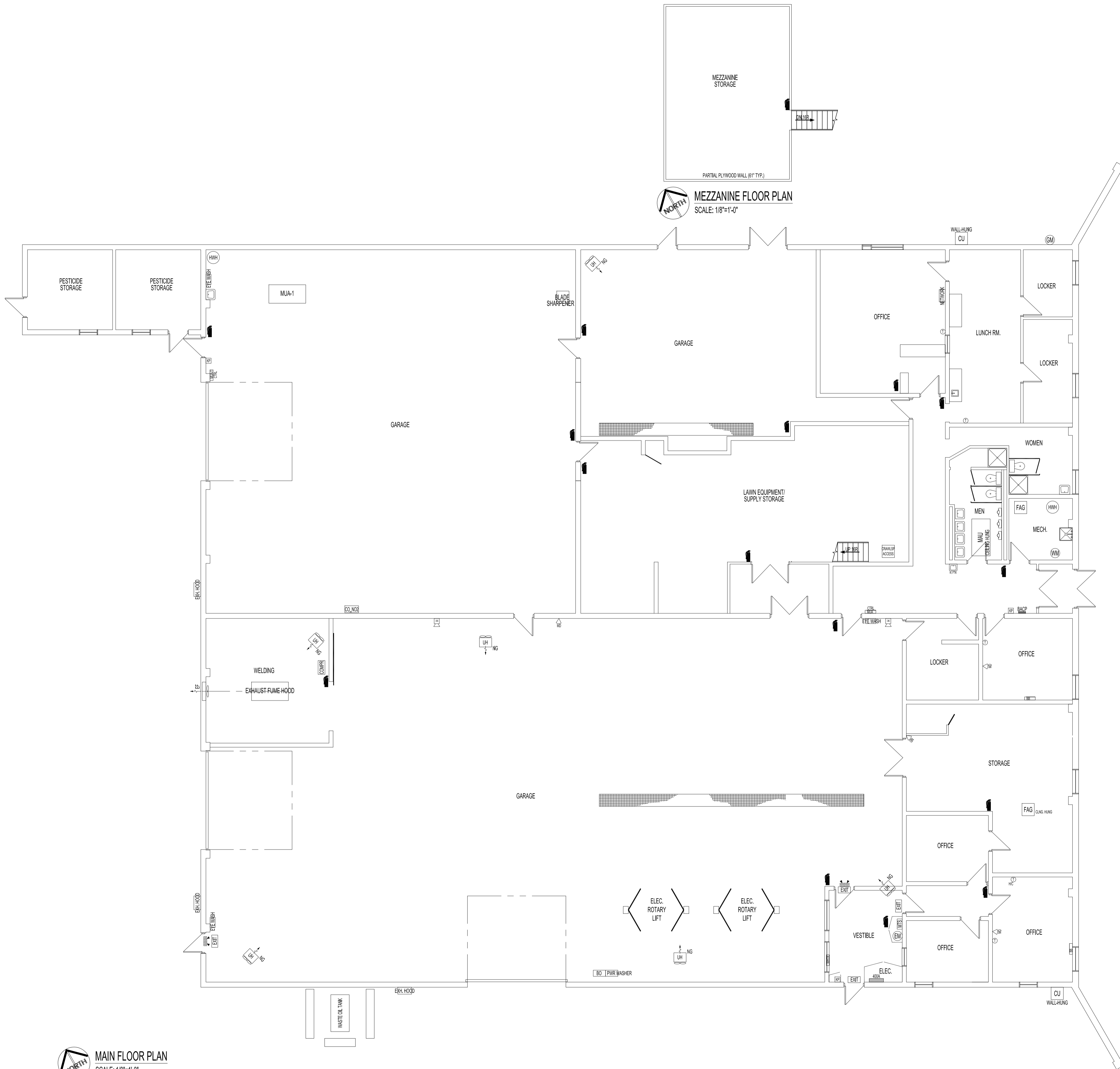
MAIN FLOOR PLAN SCALE: 1/8"=1'-0"