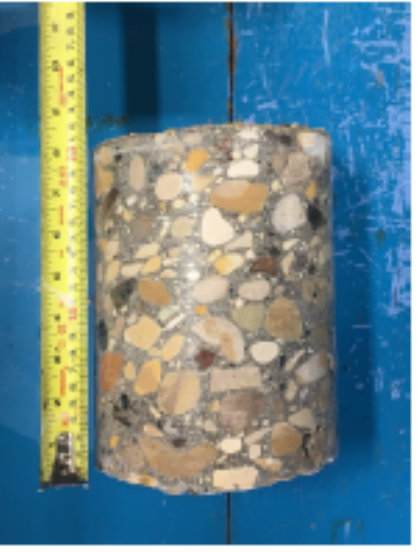
Figure 6 - C06 Core