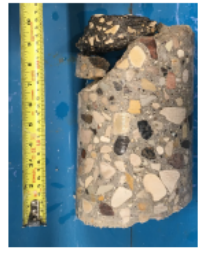
Figure 5 - C05 Core