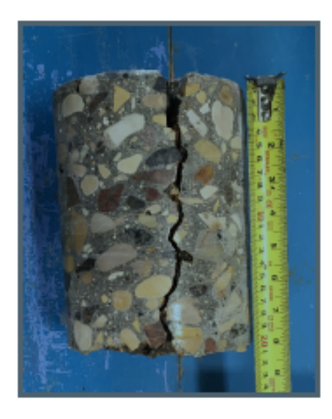
Figure 1 - C01 Core