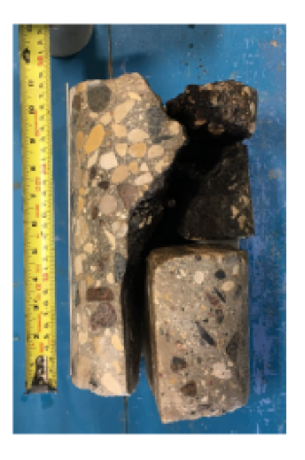
Figure 2 - C02 Core