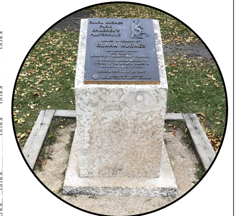
EXISTING MONUMENT TO BE MOVED