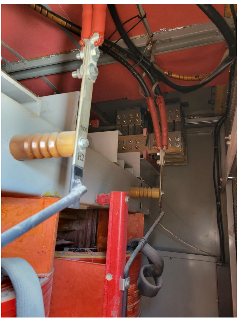
Transformer UVT-2 Photo 3