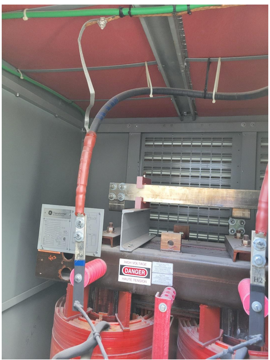
Transformer LST-4 Photo 1