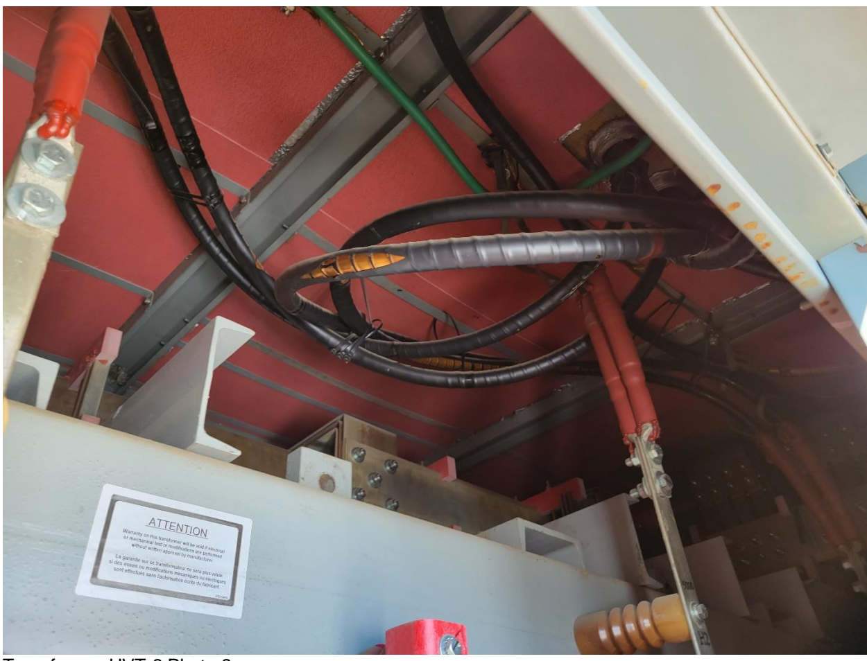
Transformer UVT-2 Photo 2