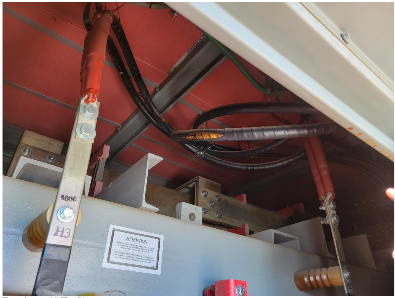
Transformer UVT-2 Photo 1

These photos are from 2023-03-17 and are more recent than the photos shown on Drawing 1-0101U-E0021-001.