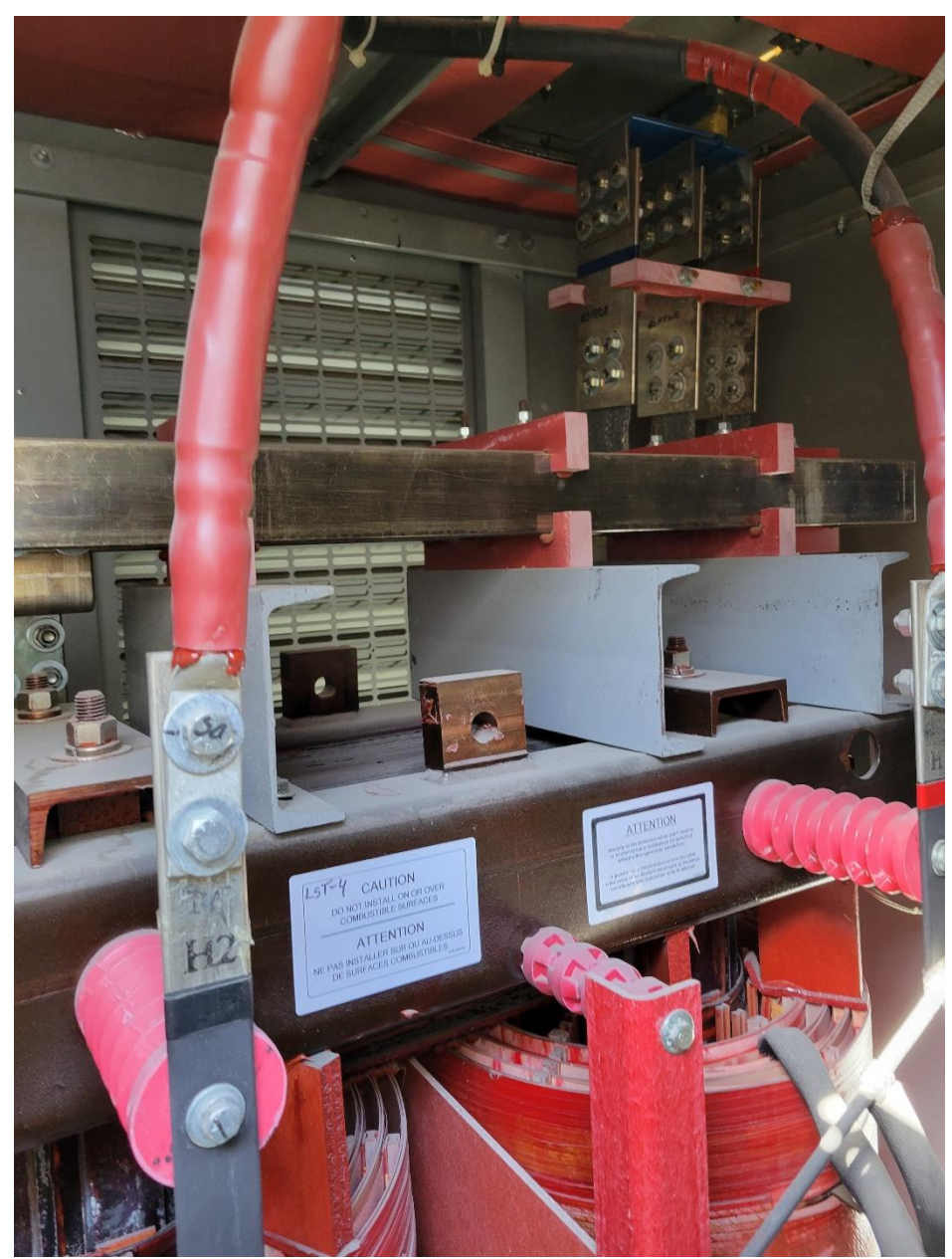
Transformer LST-4 Photo 3