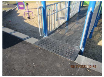
Retaining Wall w/ Ramp