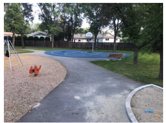
Rolled Accessible Entry