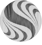
Figure No. F-5 Title DUDDLAY AVENUE

Client/Project THE CITY OF WINNIPEG PUBLIC WORKS DEPARTMENT