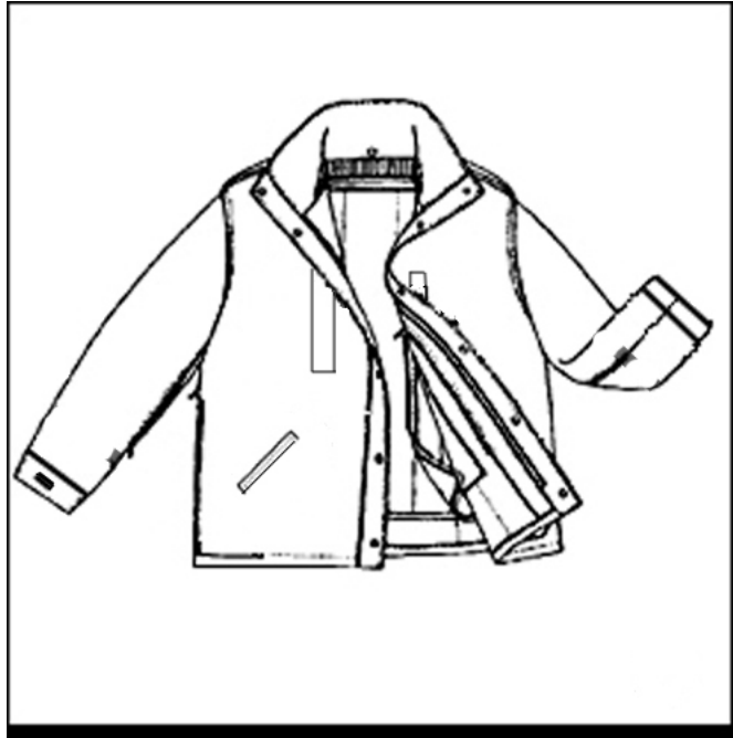
Drawing A1: Jacket

E2.3 Item No. 2 – Fleece Liner shall be as follows: