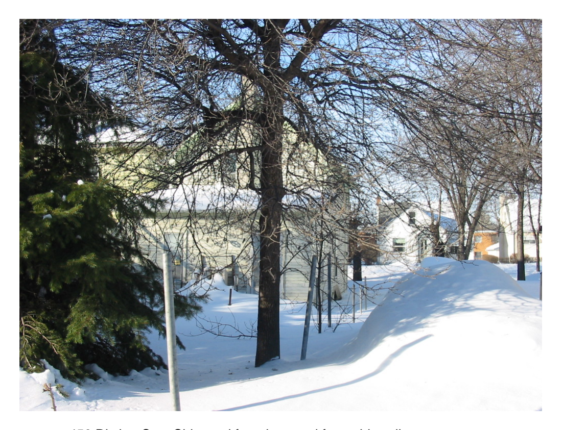
450 Ritchot St. – Side yard from lane and front sidewalk