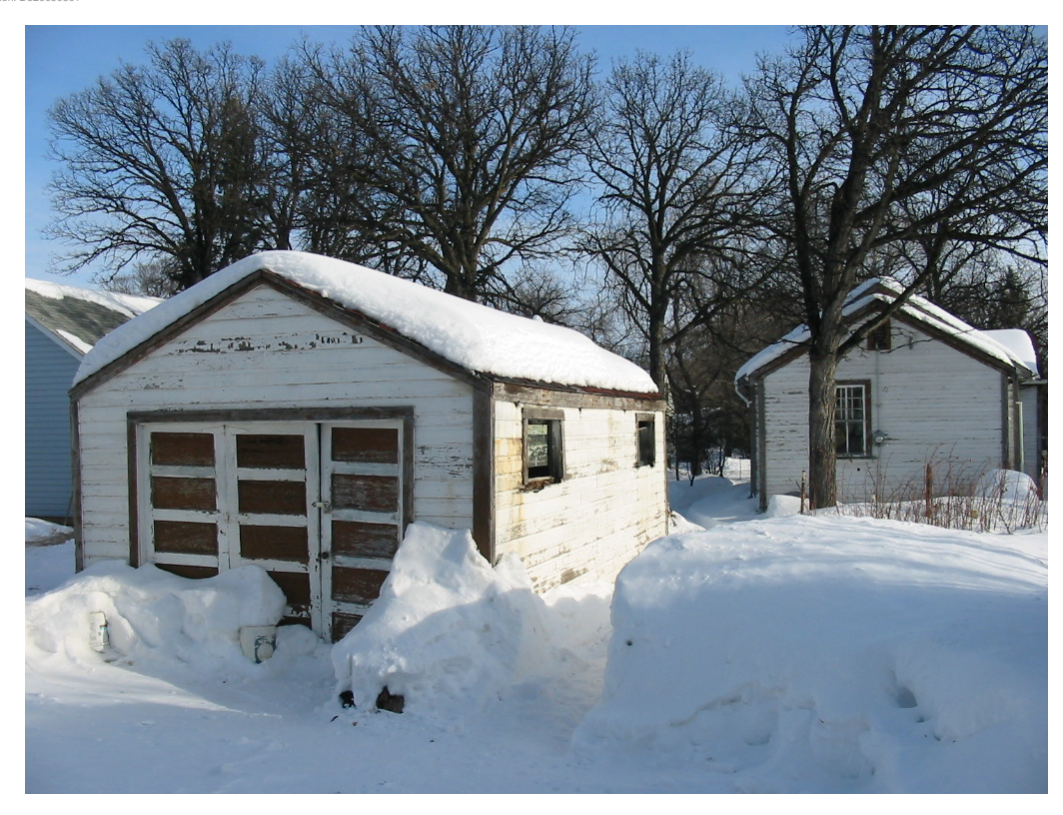
28 St. Thomas Rd. – Rear yard w. garage