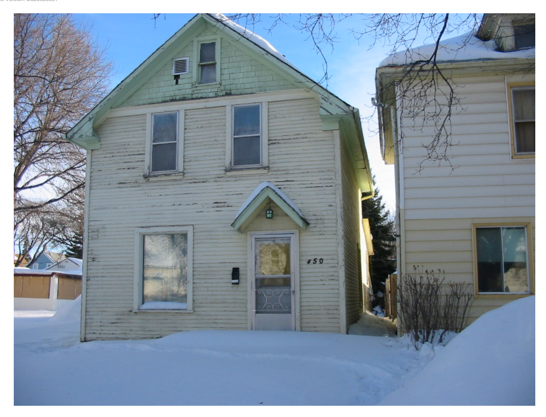
450 Ritchot Street