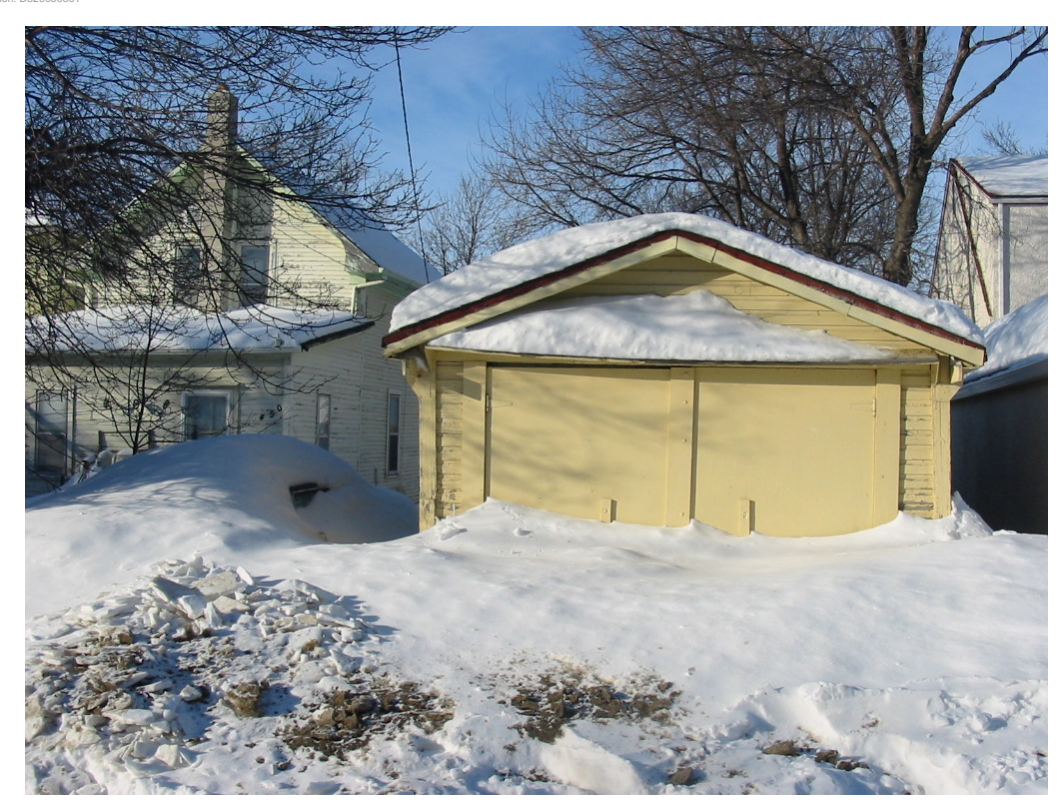
450 Ritchot St. - Garage and north side yard