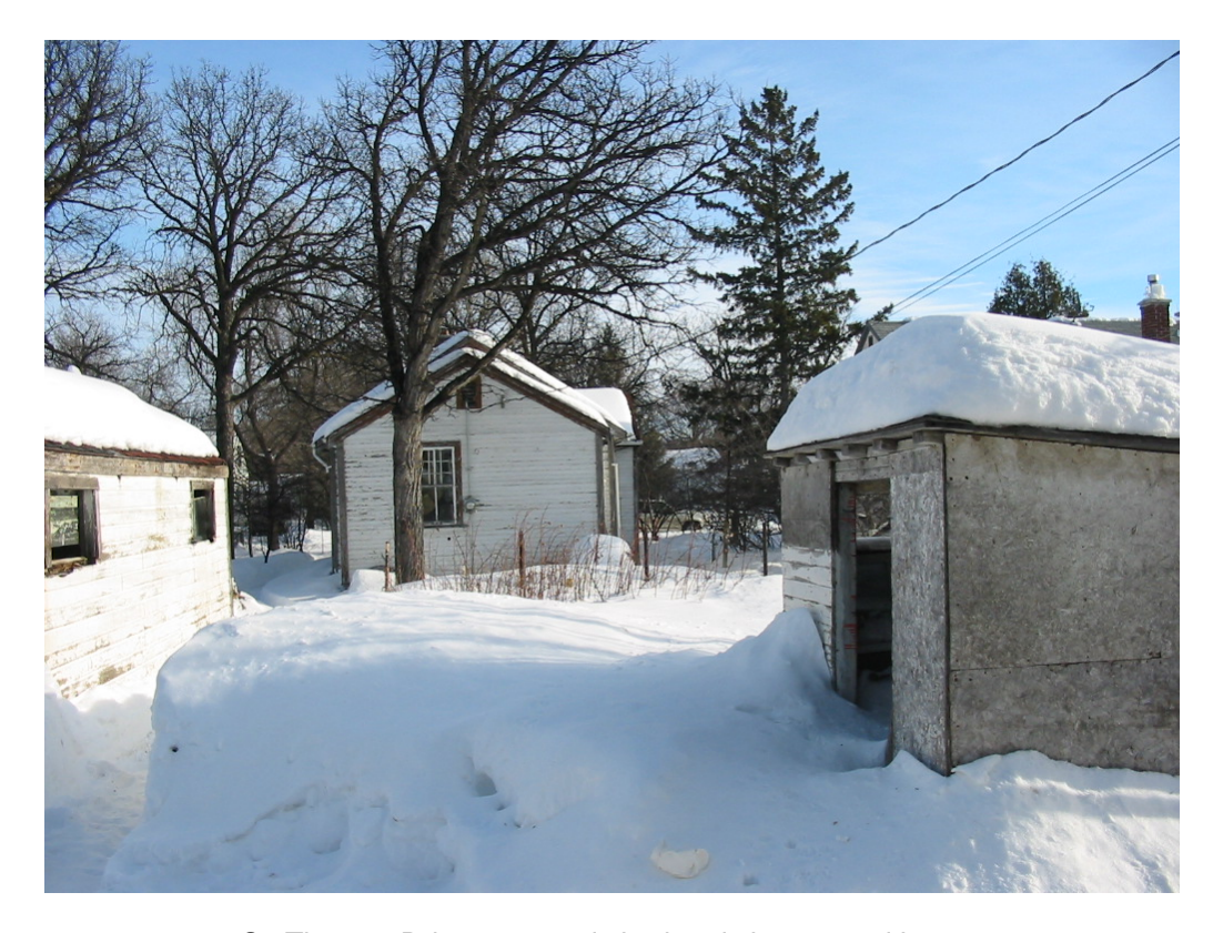
28 St. Thomas Rd. – rear yard shed and view toward lane