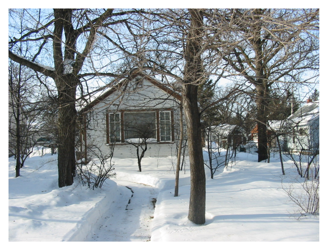
28 St. Thomas Rd.