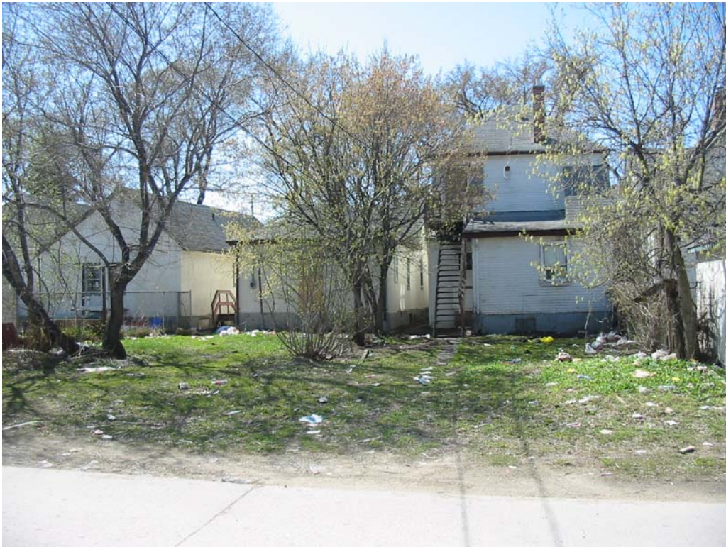
401 Aberdeen Ave.