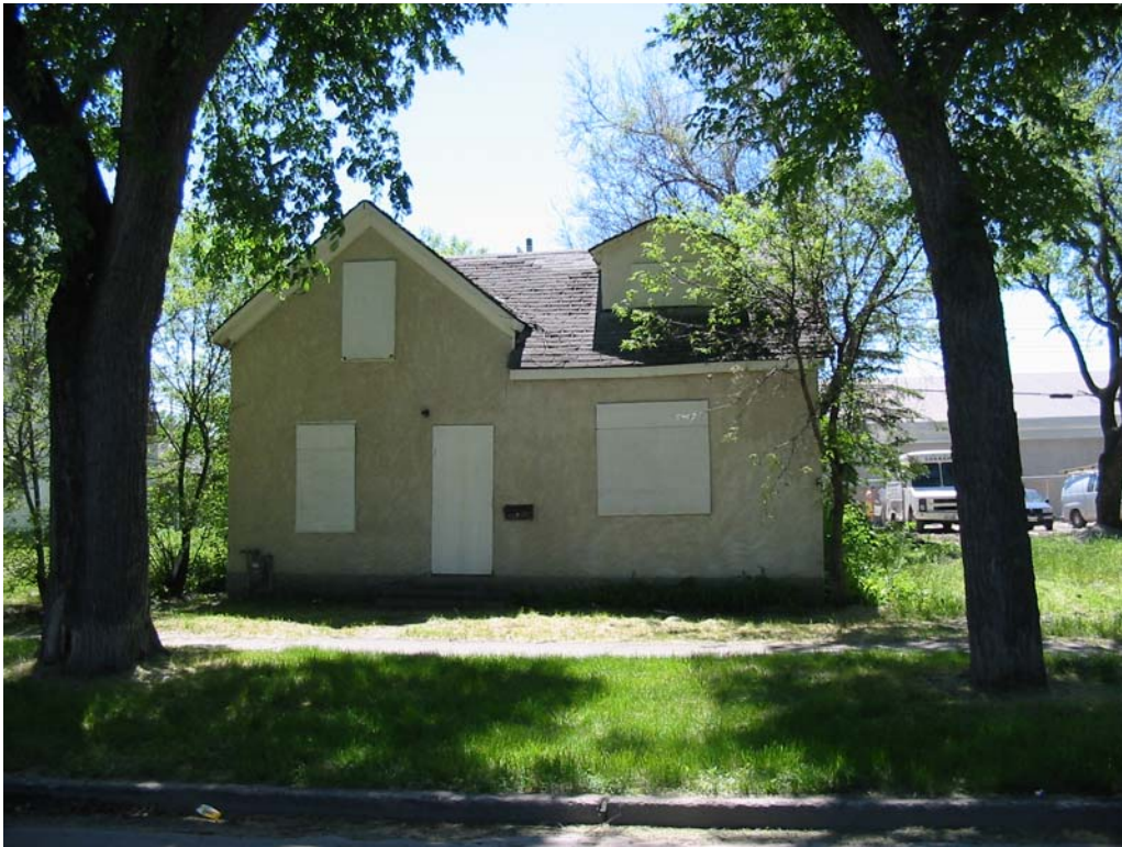
482 Pritchard Ave.