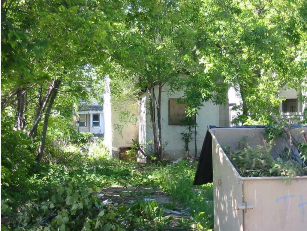
273 Pritchard Ave.