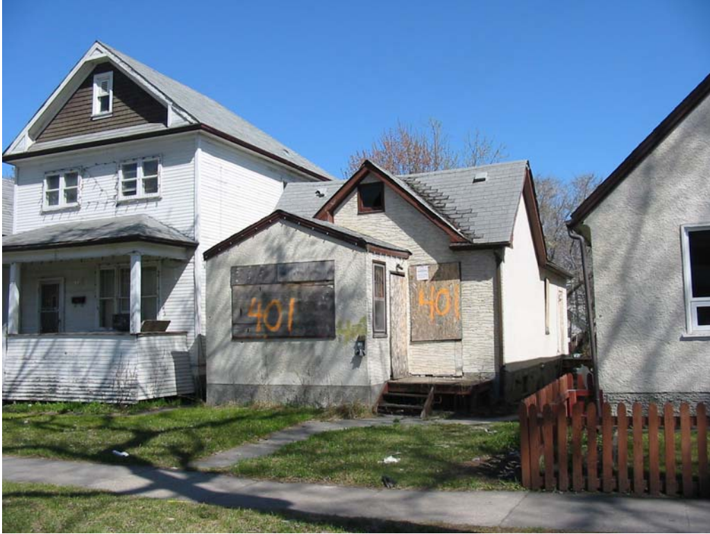
401 Aberdeen Ave.