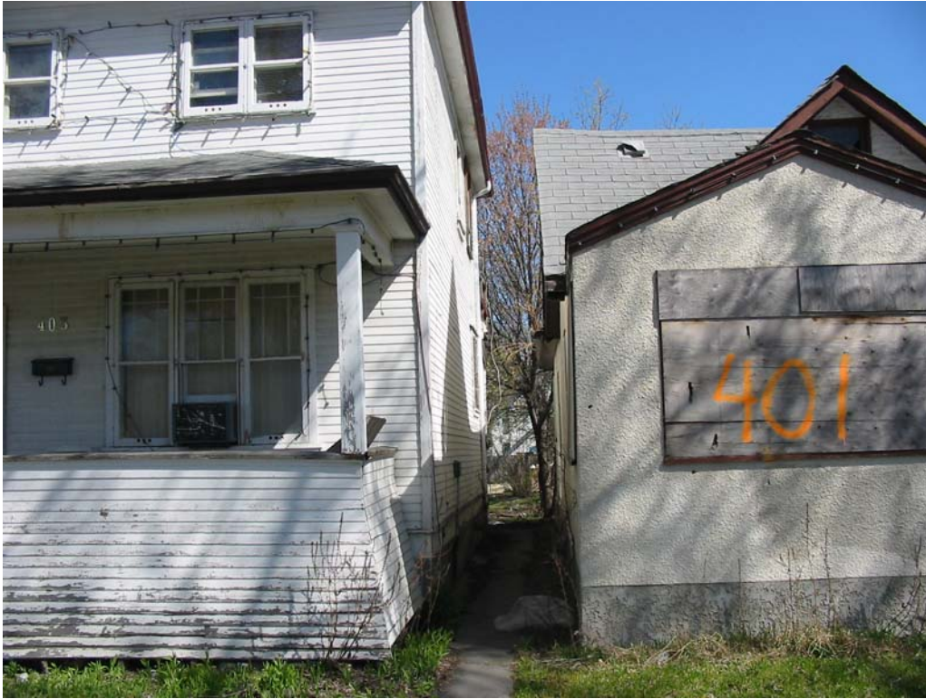
401 Aberdeen Ave.