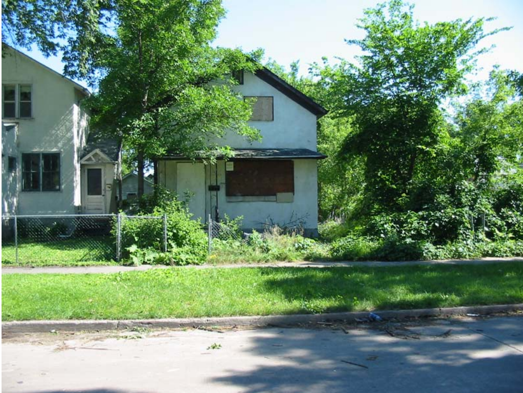
273 Pritchard Ave.