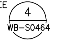
ROOF FRAMING PLAN 1:100