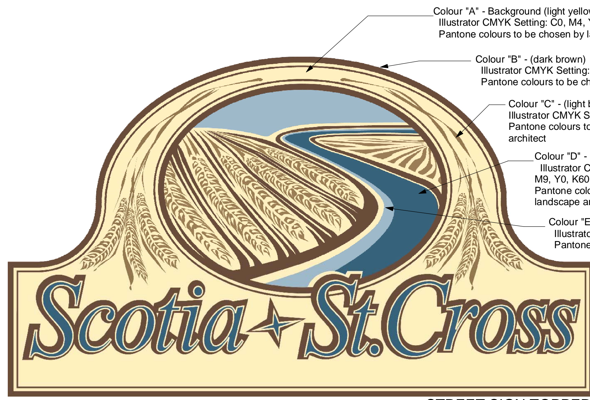
STREET SIGN TOPPER