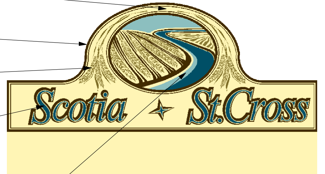
READER BOARD SIGN

NOTE: -ALL GRAPHICS WILL BE PROVIDED BY LANDSCAPE ARCHITECT IN THE FOLLOWING FILE FORMATS: 1) Adobe Illustrator File: *.AI (Both Version 4.0, and Version 10.0) 2) Adobe Illustrator EPS File : *.EPS (Both Version 4.0, and Version 10.0) 3) Adobe acrobat PDF File: *.PDF (Acrobat Version 5.0) - ALL COLOUR REFERENCE INFORMATION TO BE ASSOCIATED WITH ADOBE ILLUSTRATOR CMYK SETTINGS. -PANTONE COLOUR MATCH TO BE CHOSEN BY LANDSCAPE ARCHITECT. -ALL COLOURS WILL BE PROVIDED AS SEPARATE LAYERS IN ALL ILLUSTRATOR FILES.