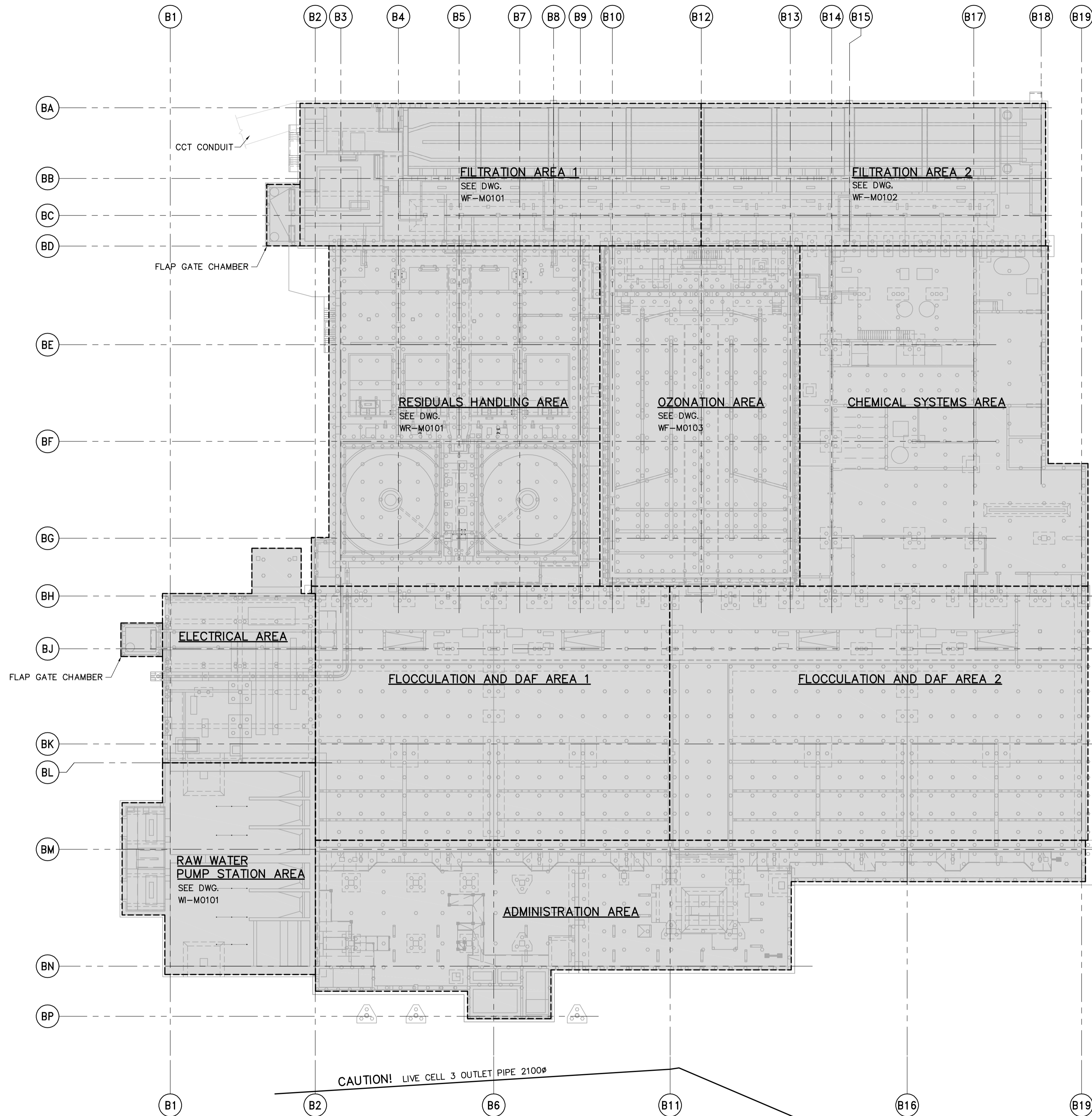
LOWER LEVEL KEY PLAN 1:300

LIMIT OF MECHANICAL AND ELECTRICAL CONTRACT 742-2005