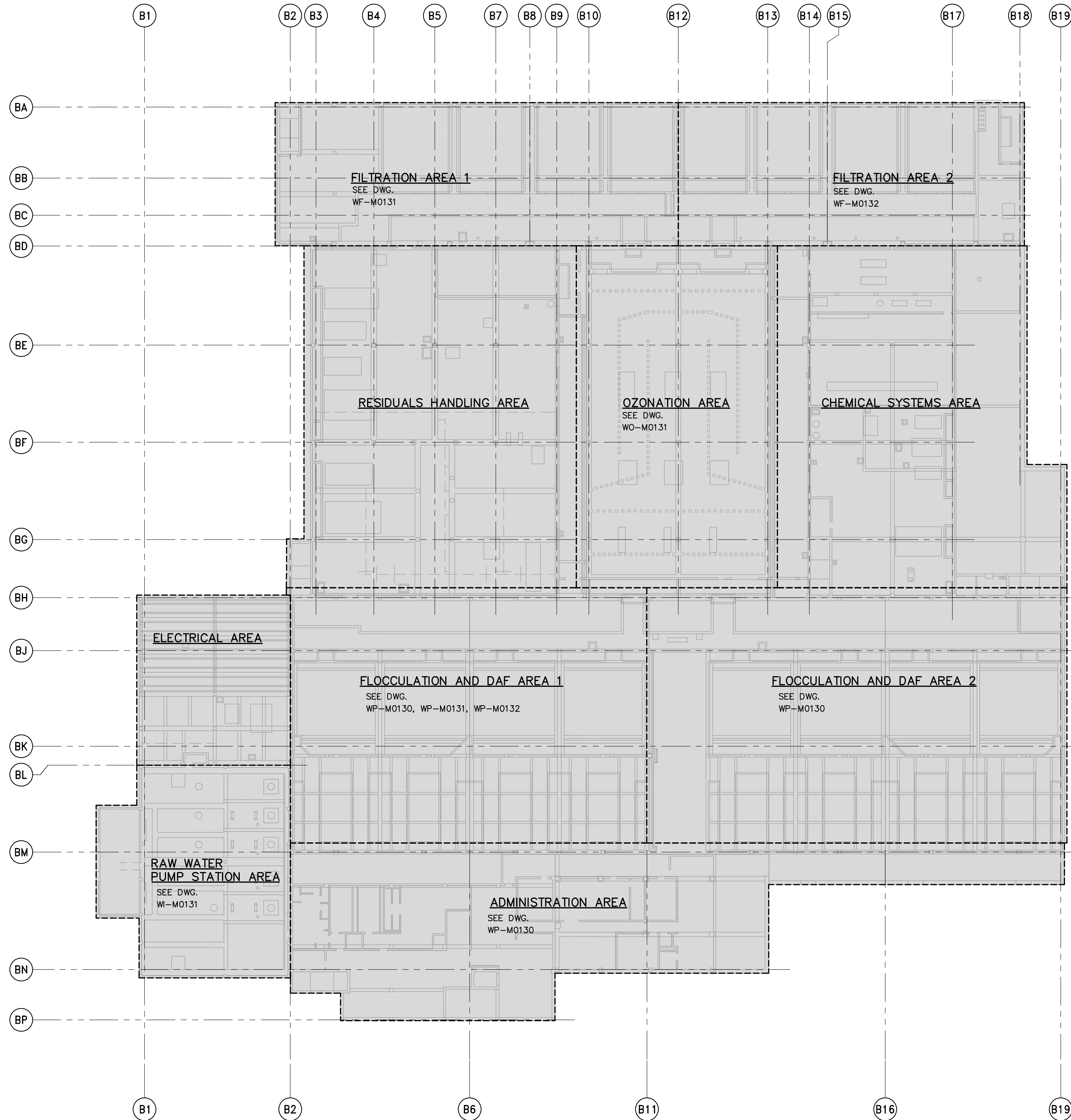
THIRD FLOOR KEY PLAN 1:300

LIMIT OF MECHANICAL AND ELECTRICAL CONTRACT 742-2005