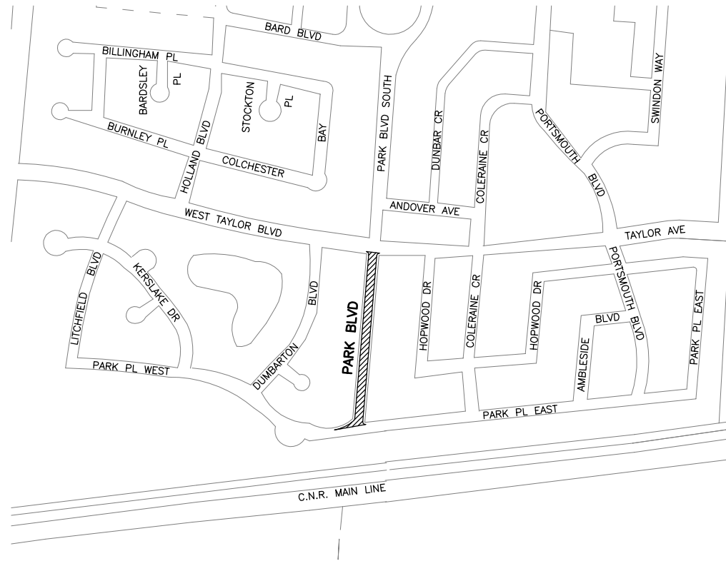
B PARK BLVD - PARK PL EAST TO WEST TAYLOR BLVD