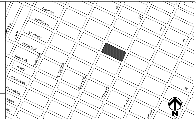
LOCATION PLAN N.T.S.