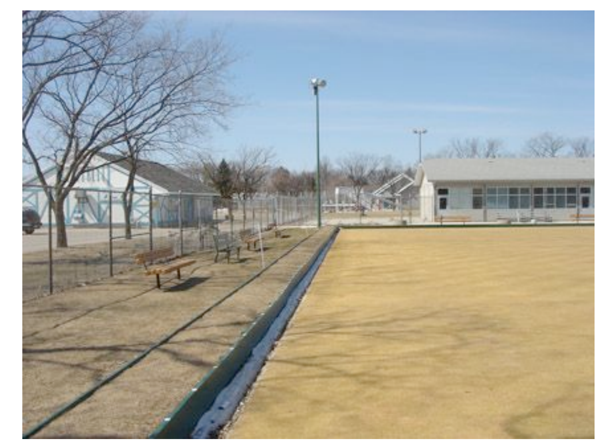
3 North Edge Existing Condition L3