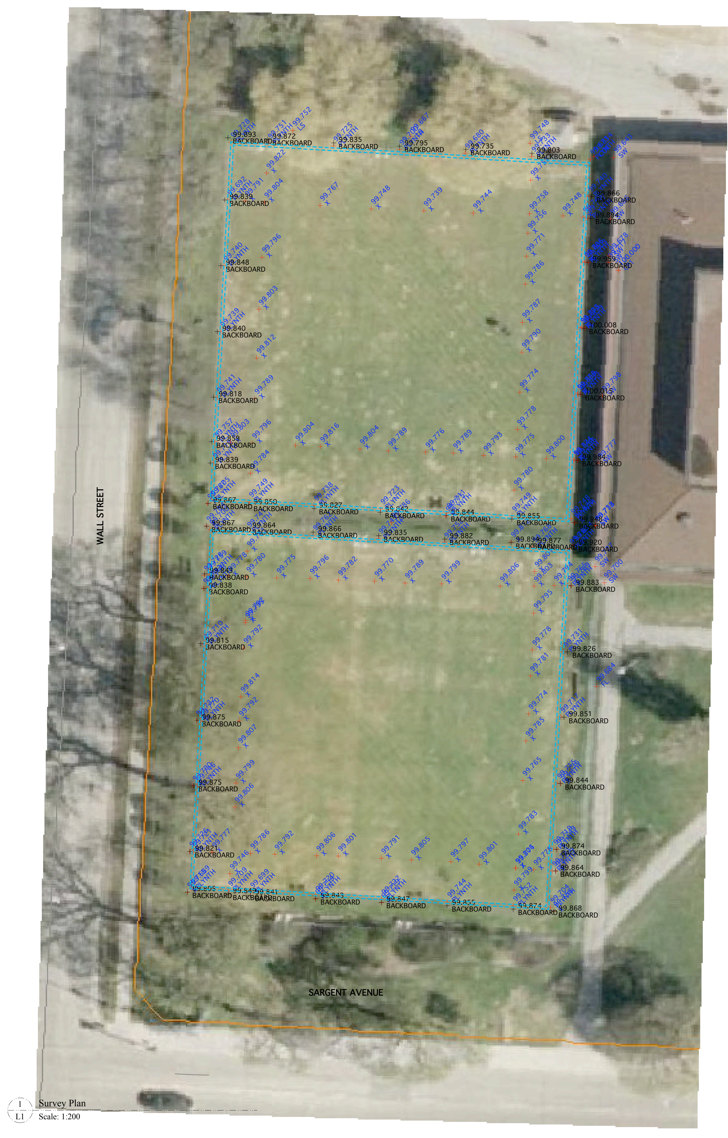
1 Survey Plan L1 Scale: 1:200