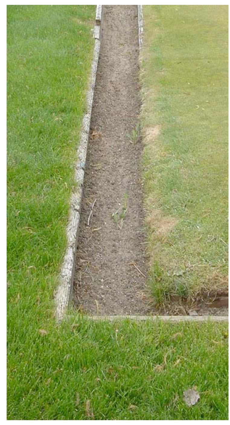
3 Typical Existing Ditch L1