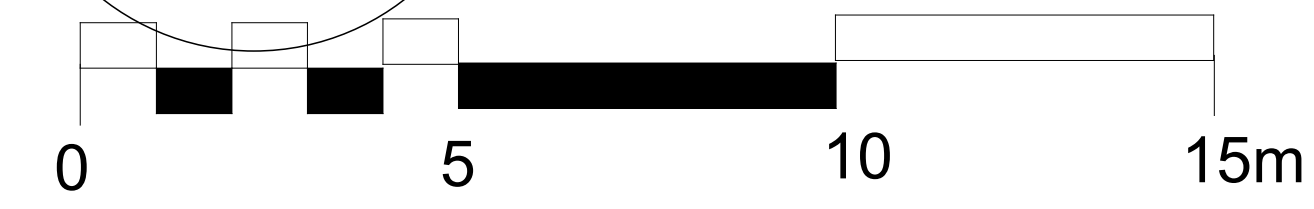
1 SITE PLAN L2 Scale: 1:100