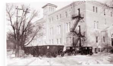
This undated picture shows the Administration Building/School at Marymound.