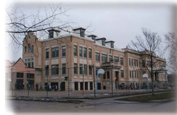
Luxton School, 111 Polson Avenue with its two stone accented entrance porticos on its main (south) façade, ca.2005.