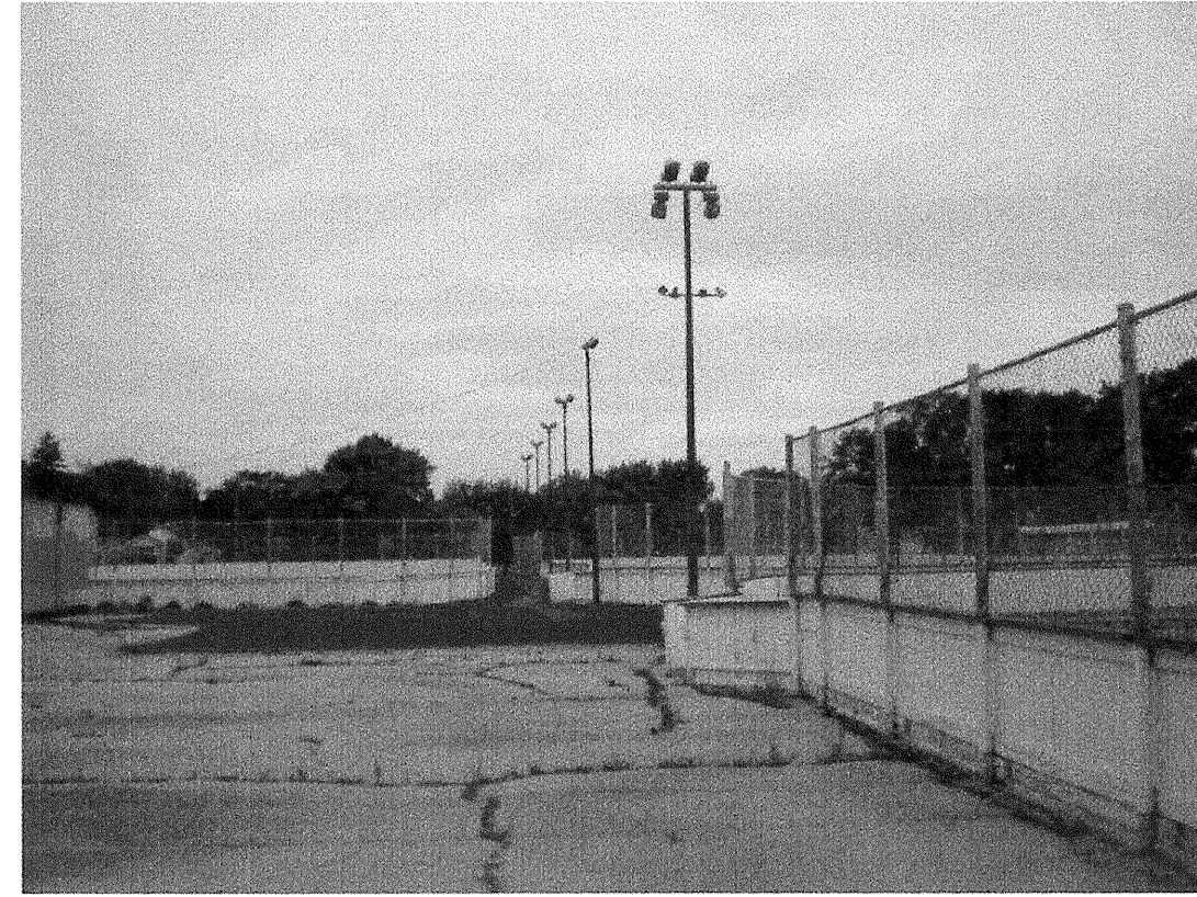
2 EXISTING LAMP STANDARDS E.T.O. NTS