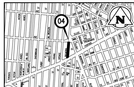
SITE LOCATION #04