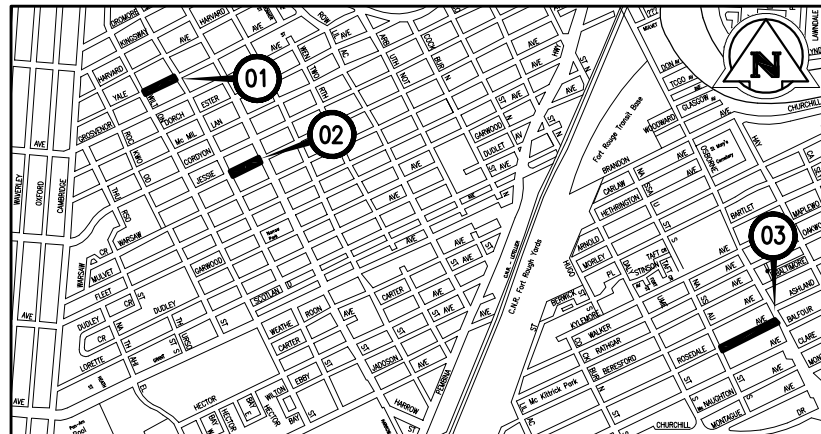
SITE LOCATIONS #01, #02 & #03