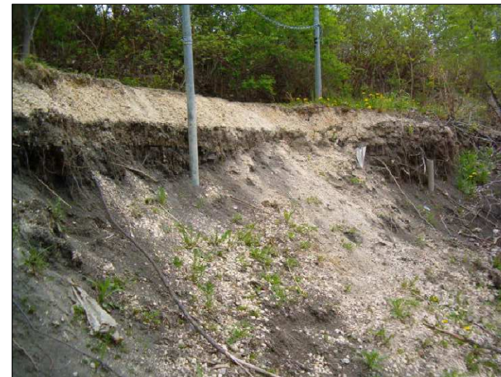
PHOTOGRAPH 13: FACING NORTH - AT STATION 1+95, PRIMARY FAILURE ZONE, AREA OF GABION BASKET RETAINING WALL AND RIP-RAP PROTECTION BLANKET