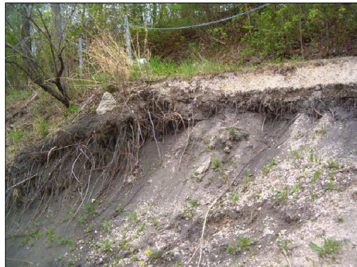
PHOTOGRAPH 12: FACING SOUTH - AT STATION 1+95, PRIMARY FAILURE ZONE, AREA OF GABION BASKET RETAINING WALL AND RIP-RAP PROTECTION BLANKET