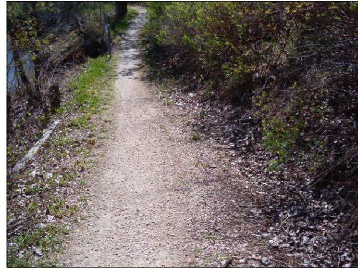
PHOTOGRAPH 10: FACING SOUTH - AT STATION 1+85