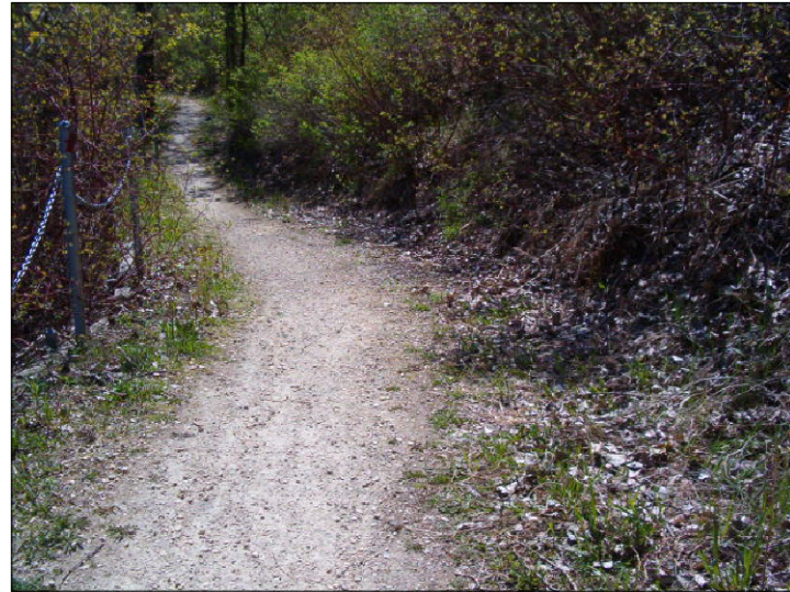
PHOTOGRAPH 9: FACING SOUTH - AT STATION 1+80