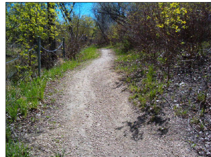
PHOTOGRAPH 16: FACING SOUTH - AT STATION 2+47, END OF WALKWAY