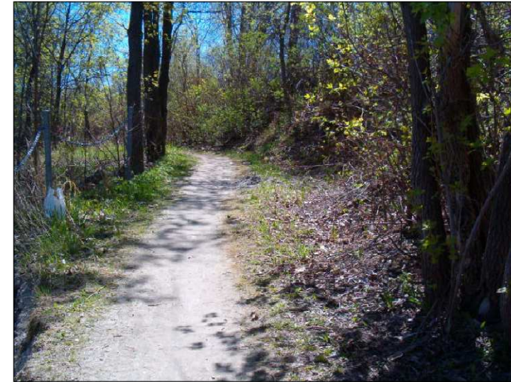
PHOTOGRAPH 11: FACING SOUTH - AT STATION 1+95, PRIMARY FAILURE ZONE ON LEFT