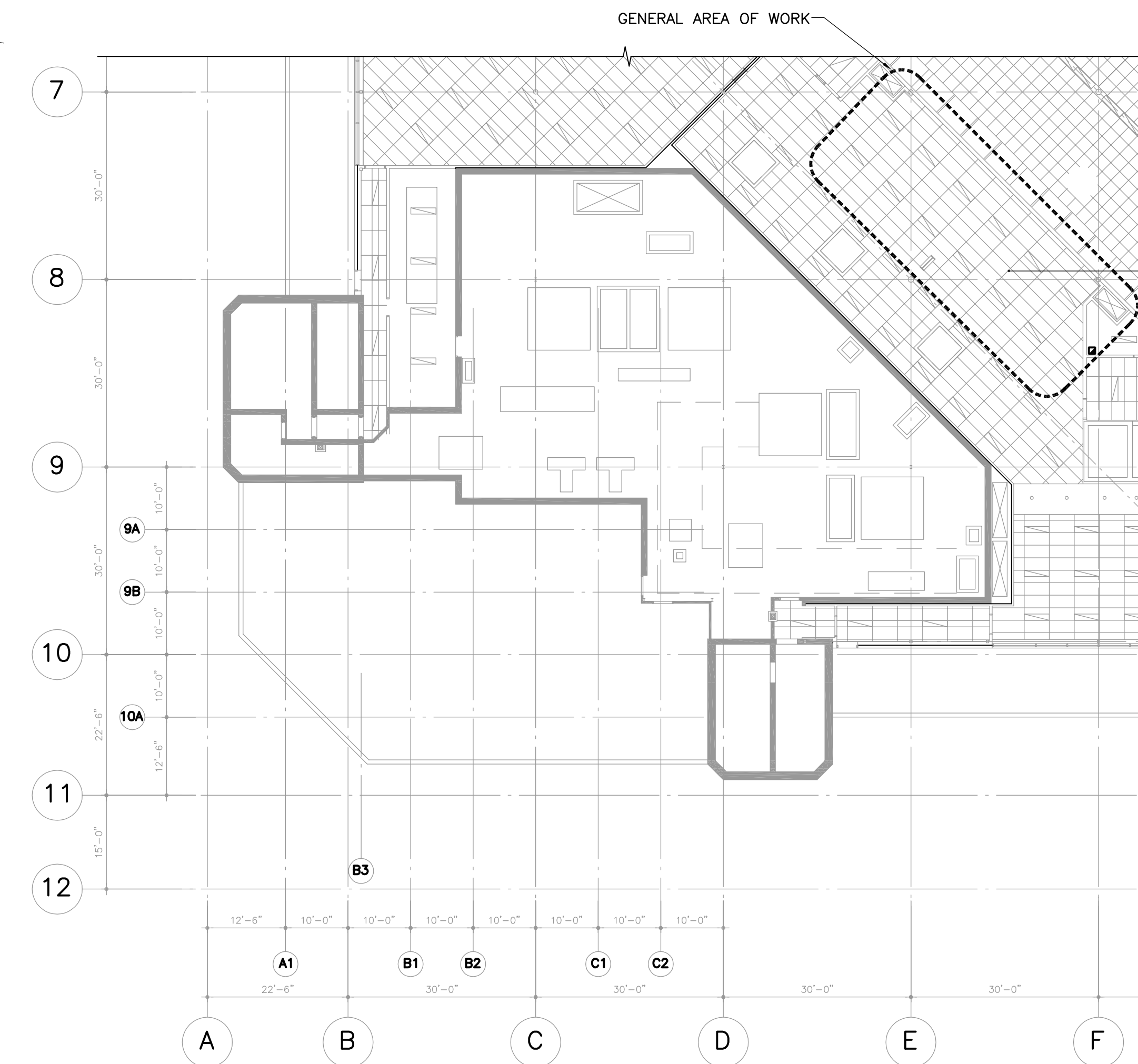
EXISTING PARTIAL 4TH FLOOR REFLECTED CEILING PLAN