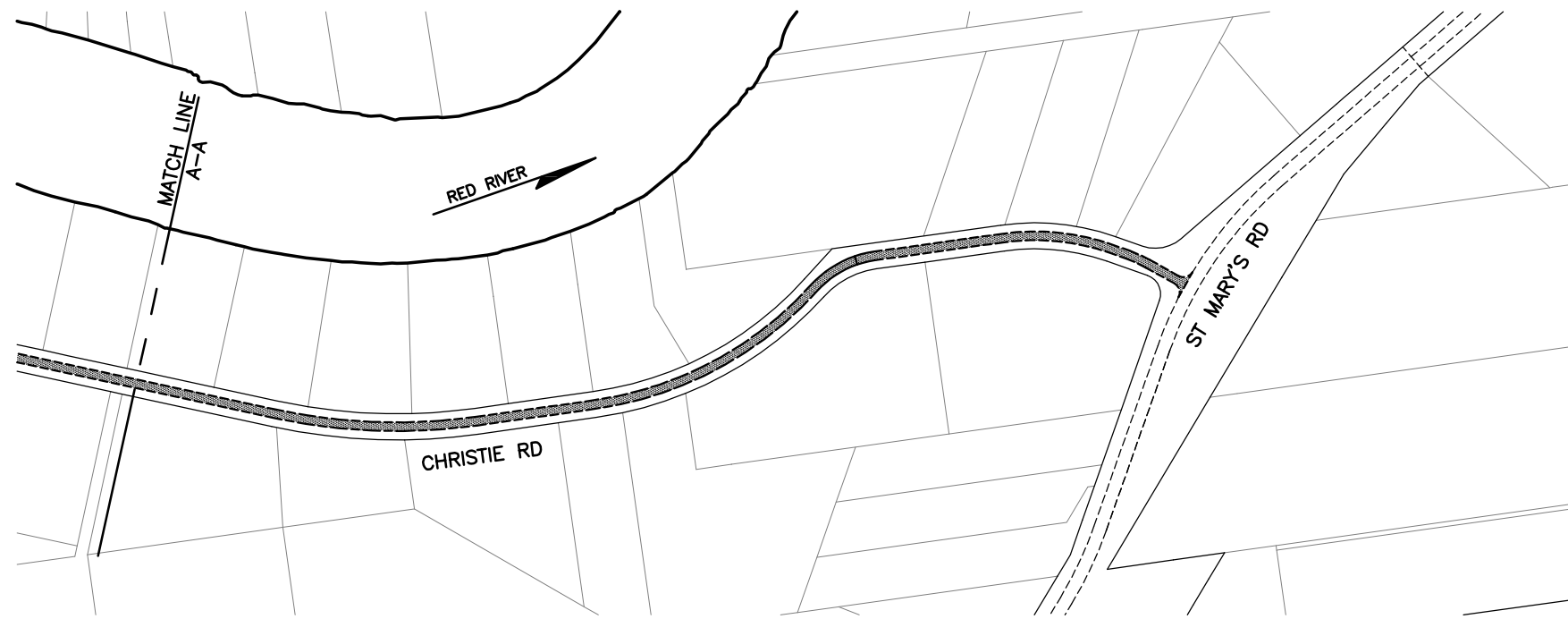
PLAN - CHRISTIE RD SCALE: 1:2500

NOTE: CHIP SEAL COAT RESURFACING TO BE PERFORMED WITHIN THE SHADED AREA SHOWN ABOVE, AS DIRECTED BY THE CONTRACT ADMINISTRATOR.