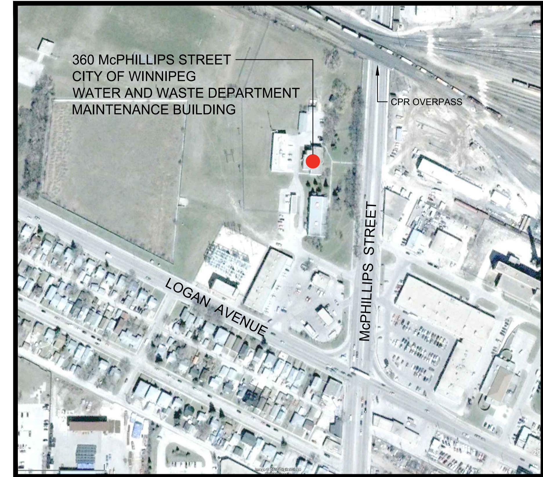
LOCATION PLAN N.T.S.