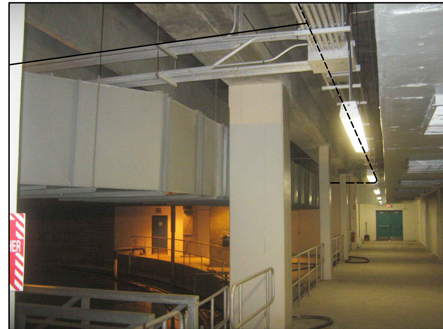
6 CLARIFIER 3 AREA E0007 SCALE: NTS