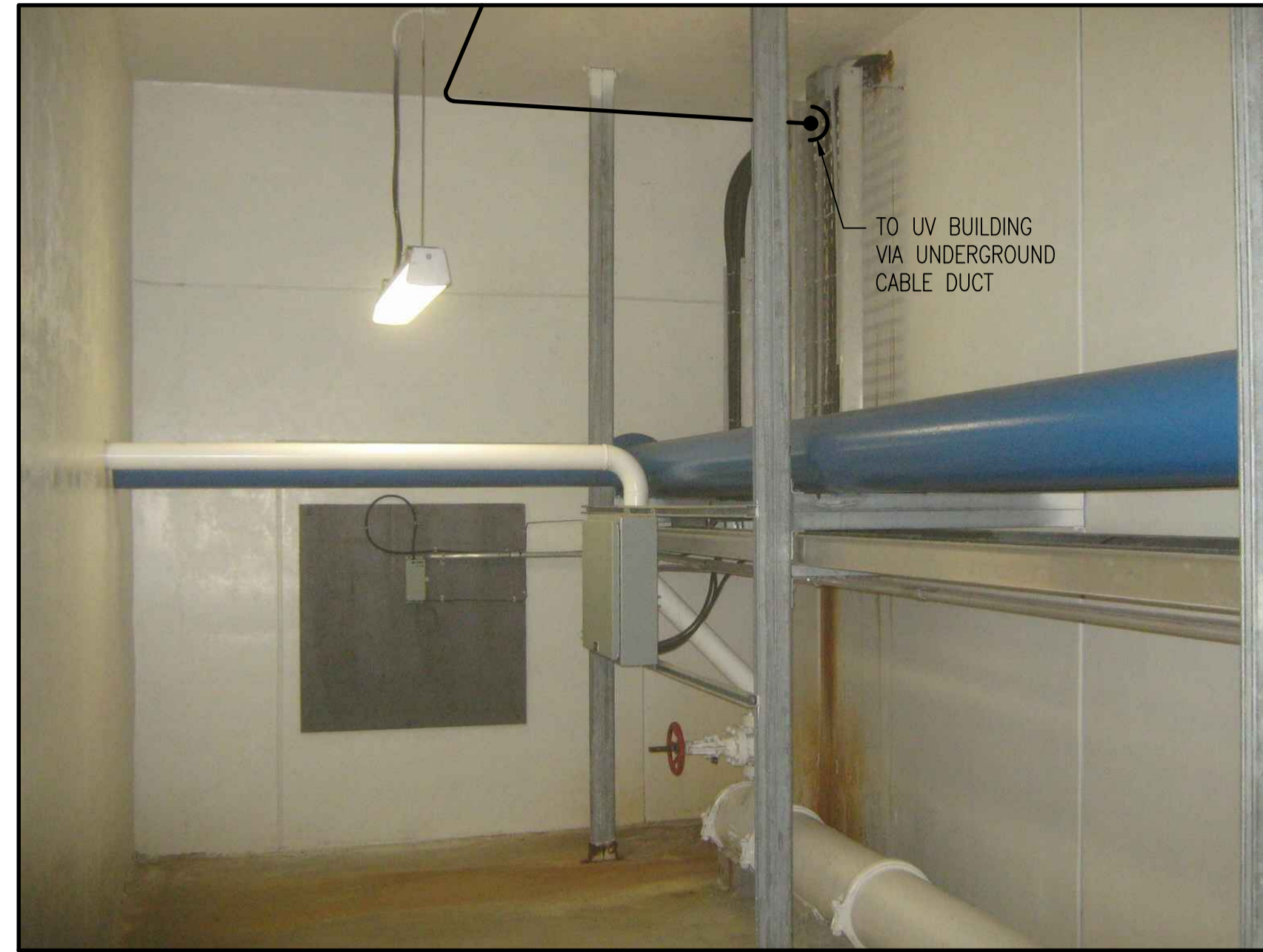
3 WEST END OF GALLERY 3 E0008 SCALE: NTS