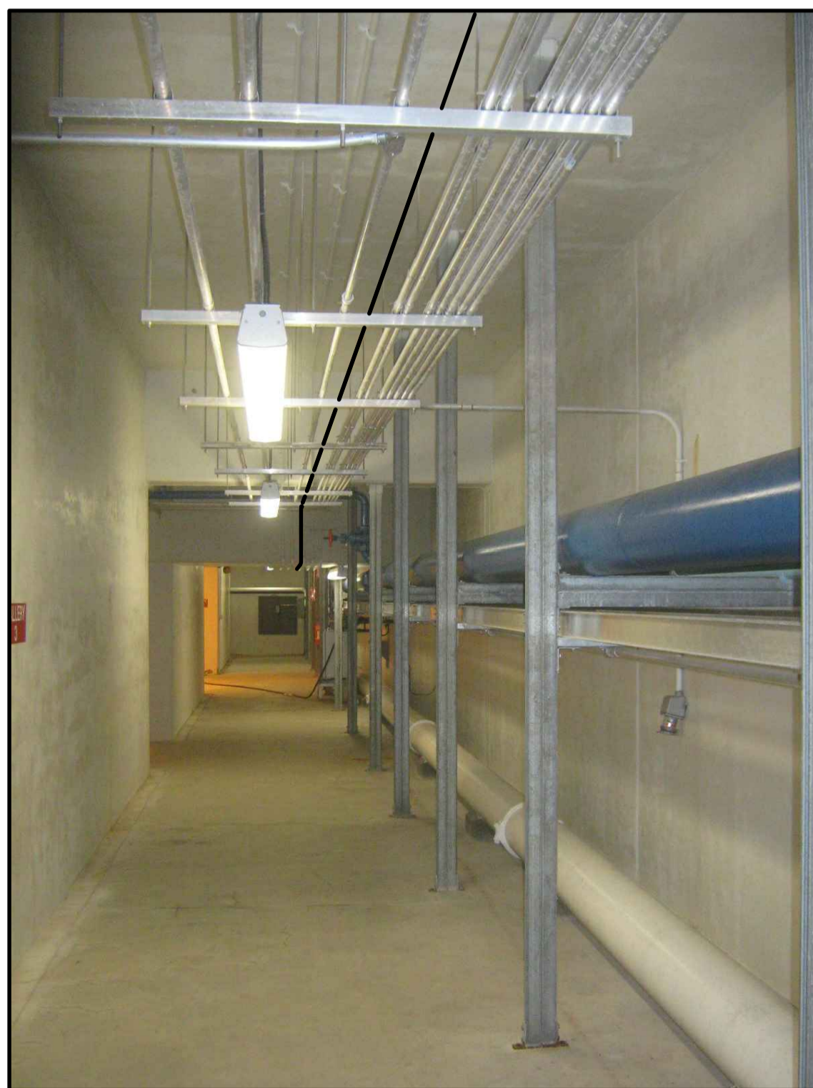
2 GALLERY 3 NEAR CLARIFIER 3 E0008 SCALE: NTS