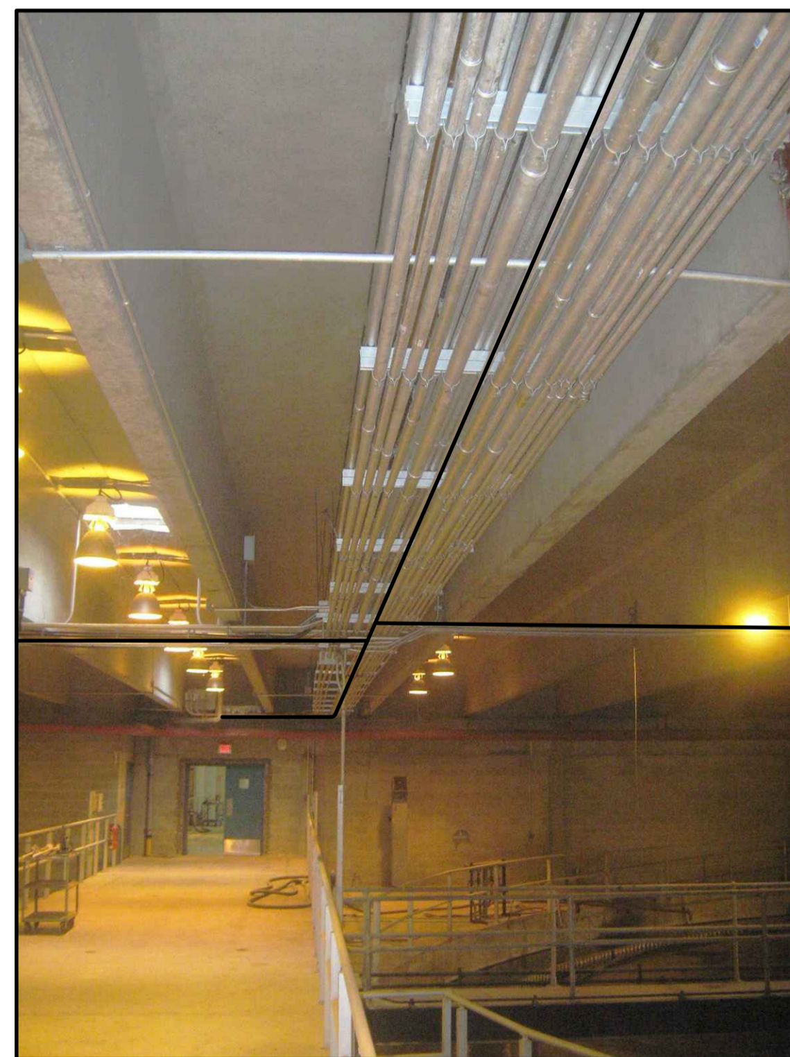
4 CLARIFIER 182 AREA E0004 SCALE: NTS