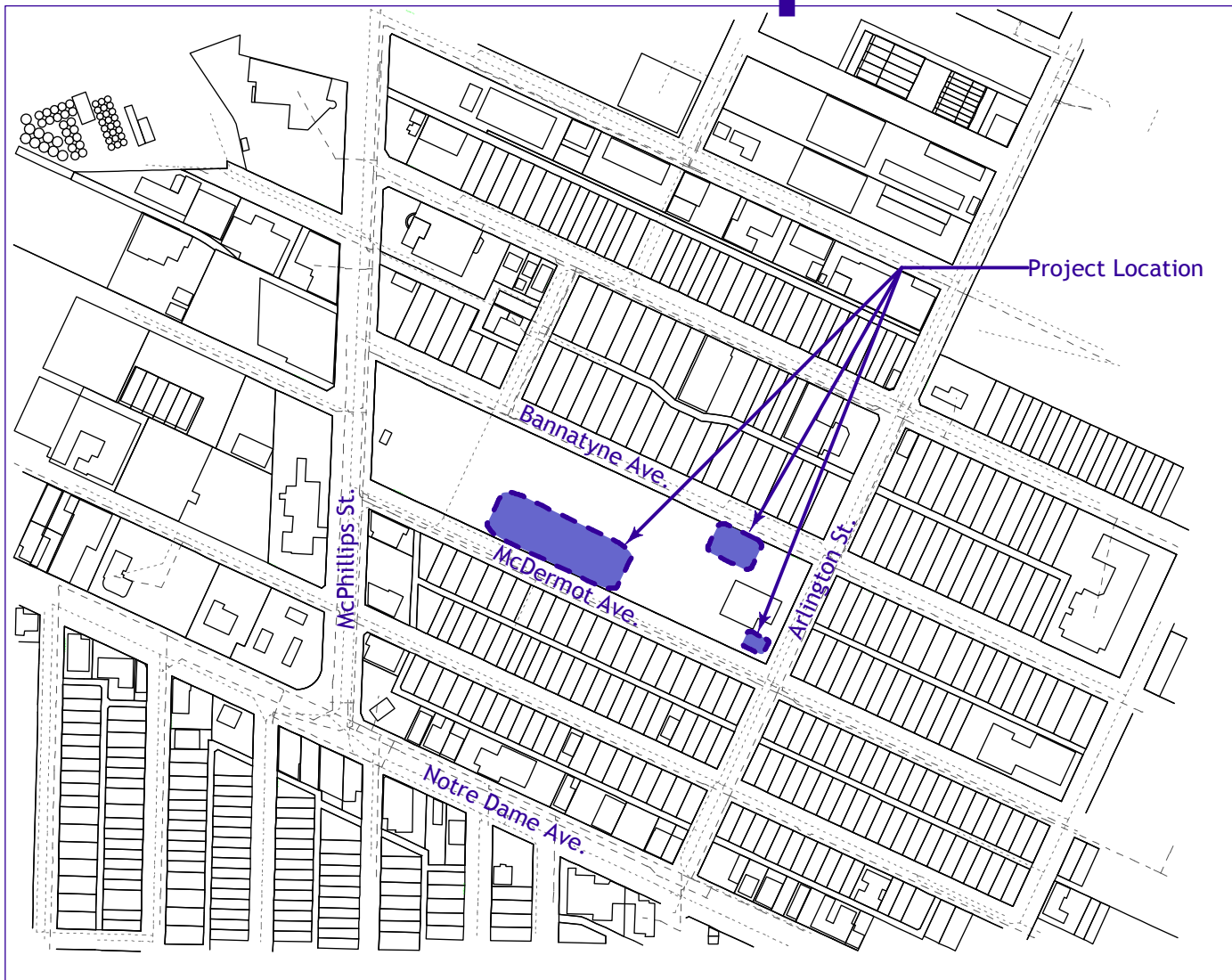
1 Site Context L-1 Scale: 1:5000