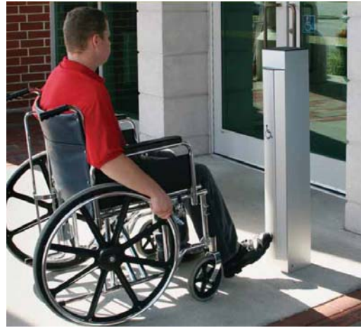
Dark Bronze Finish