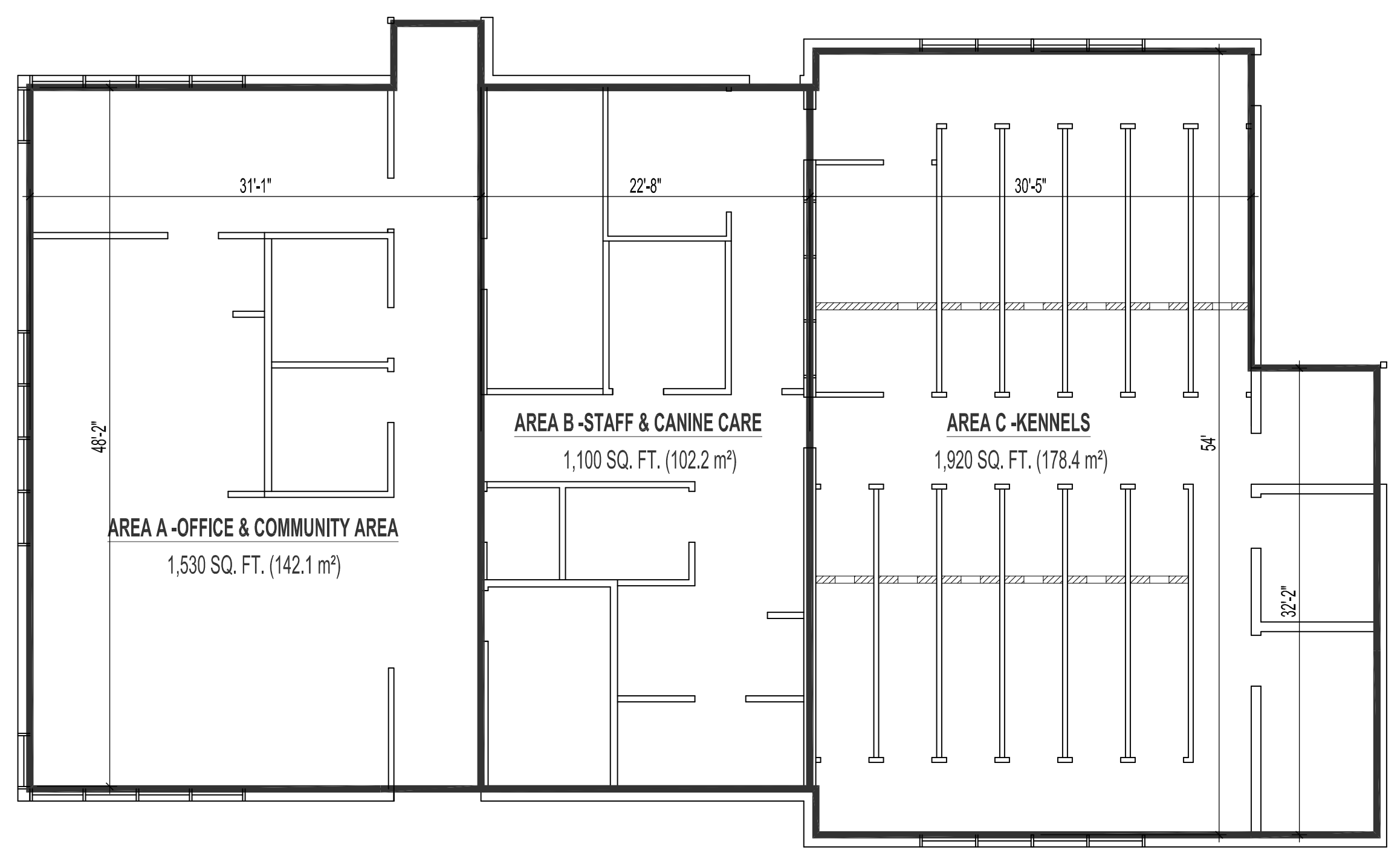
77 DURAND ROAD -CANINE UNIT, FLOOR PLAN AREAS IN SQUARE FEET /METRES SCALE: 1/8"=1'-0"

BUILDING AREA GROSS AREA -4,780 SQ. FT. TOTAL (444.1 m 2 ) INTERIOR AREA -4,550 SQ. FT. TOTAL (423.0 m 2 ) AREA 'A' -1,530 SQ. FT. (142.1 m 2 ) AREA 'B' -1,100 SQ. FT. (102.2 m 2 ) AREA 'C' -1,920 SQ. FT. (178.4 m 2 )