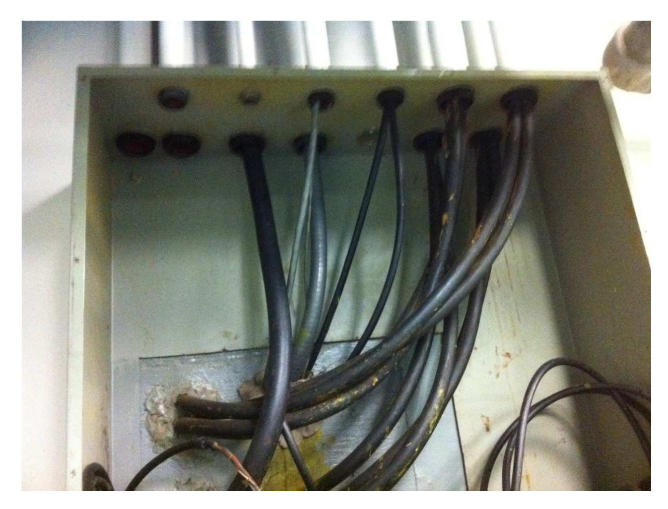
Reservoir Valve House Pullbox Located at south end of the pumping station on the Mezzanine Level