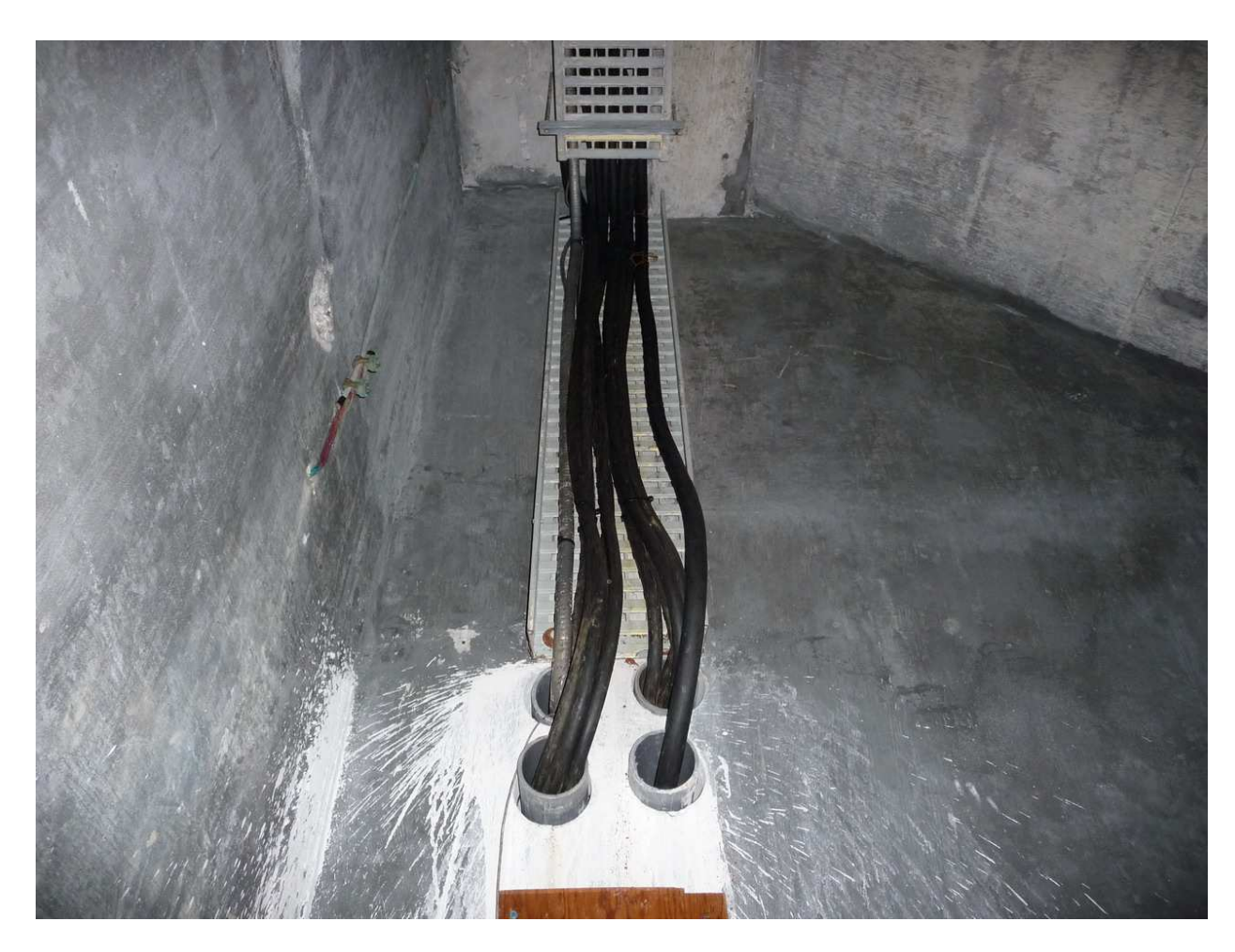
Reservoir Valve House – Incoming Feeder Cables