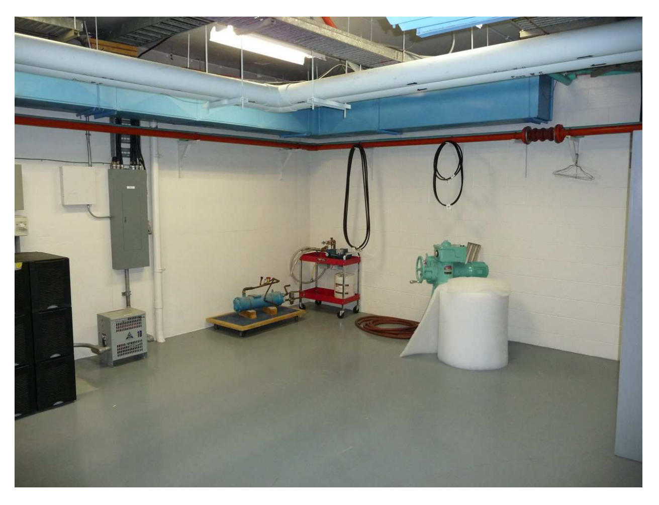
Existing Ductwork Below Electrical Room North-West Corner of Mezzanine Level