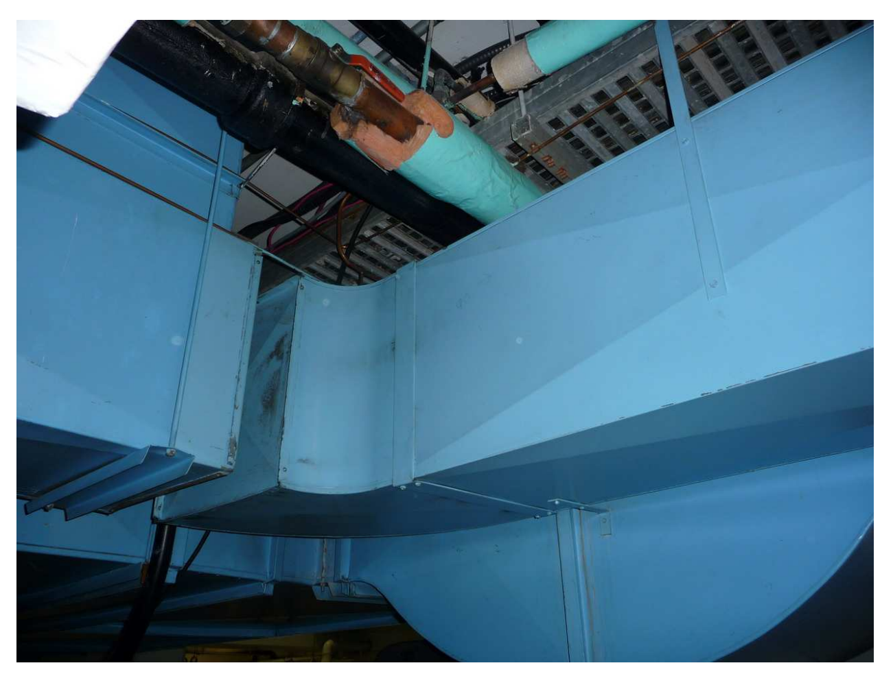
Entry point of conduits routed to roof Note: the conduits are obscured by piping in this picture