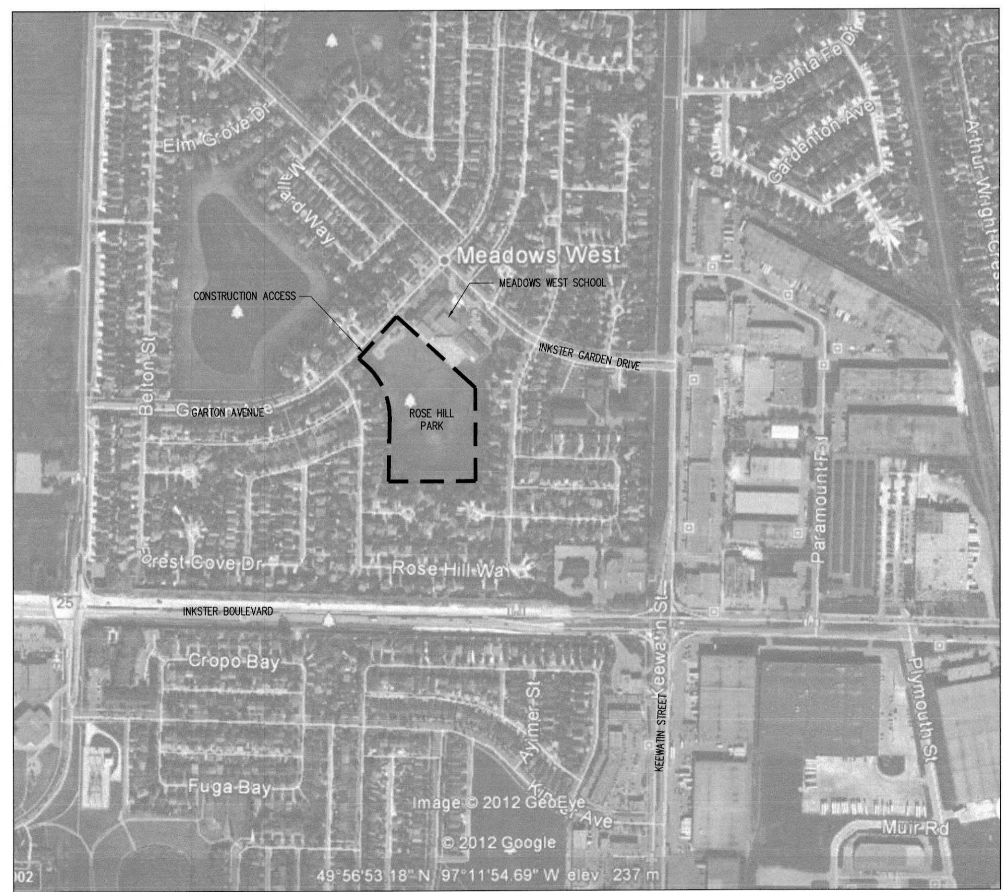
2 L1.0 SITE LOCATION PLAN NTS