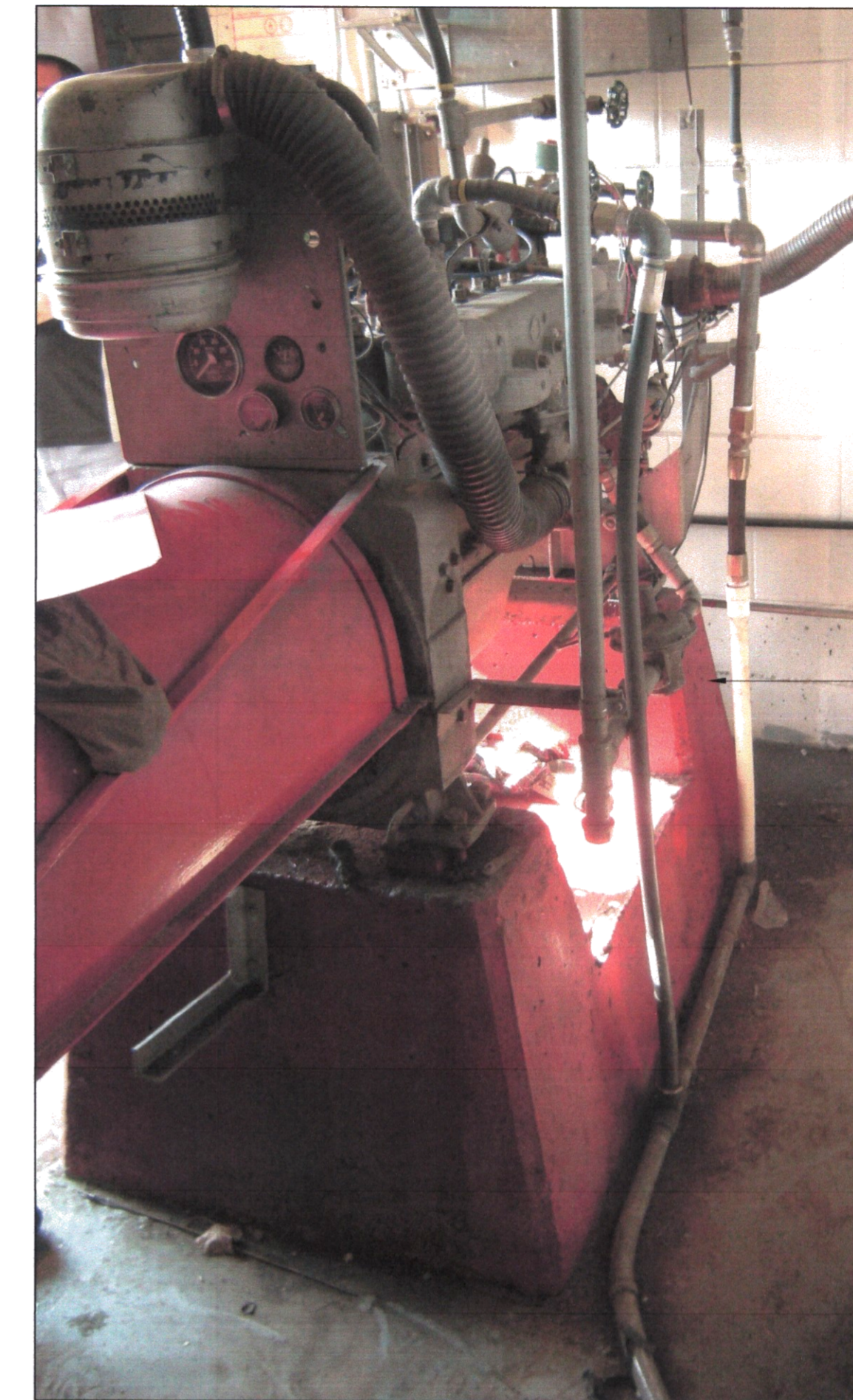
3 ENGINE BASE DETAIL SCALE: N.T.S.