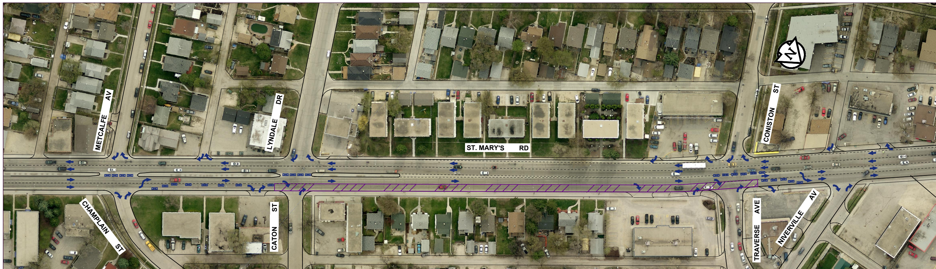
ST.MARY'S NORTHBOUND GUTTER CONSTRUCTION - PM