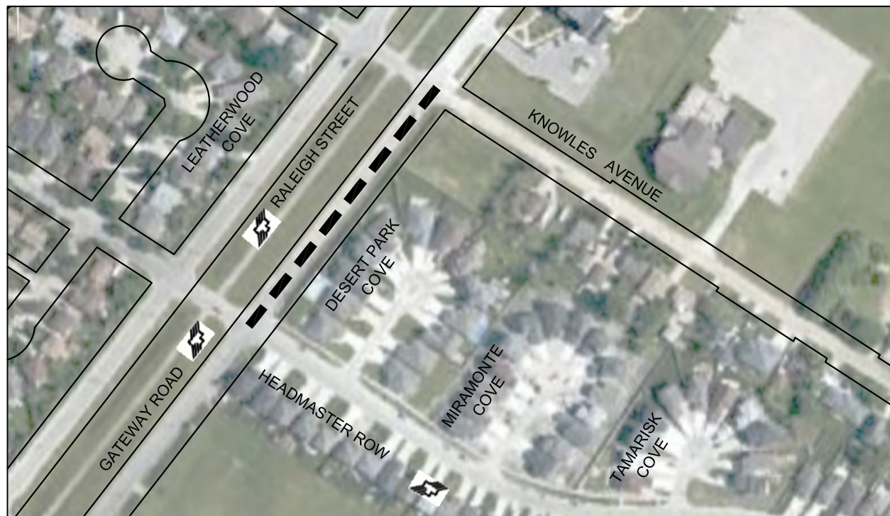
GATEWAY ROAD - HEADMASTER ROW / KNOWLES AVENUE

Jun 27, 2013 - 2:43pm P:\5513001-5513099\5513066 - 2013 Thin Bituminous Overlay Program\MMM Drawings\Contract 1\Drawings\Contract 1 dwgs\331-2013.1-01 to 05\140613.dwg - tab:05