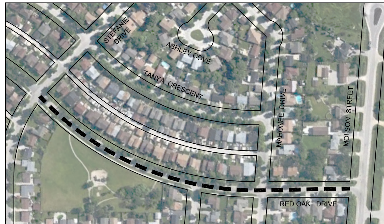
RED OAK DRIVE - STEFANIE DRIVE / MOLSON STREET