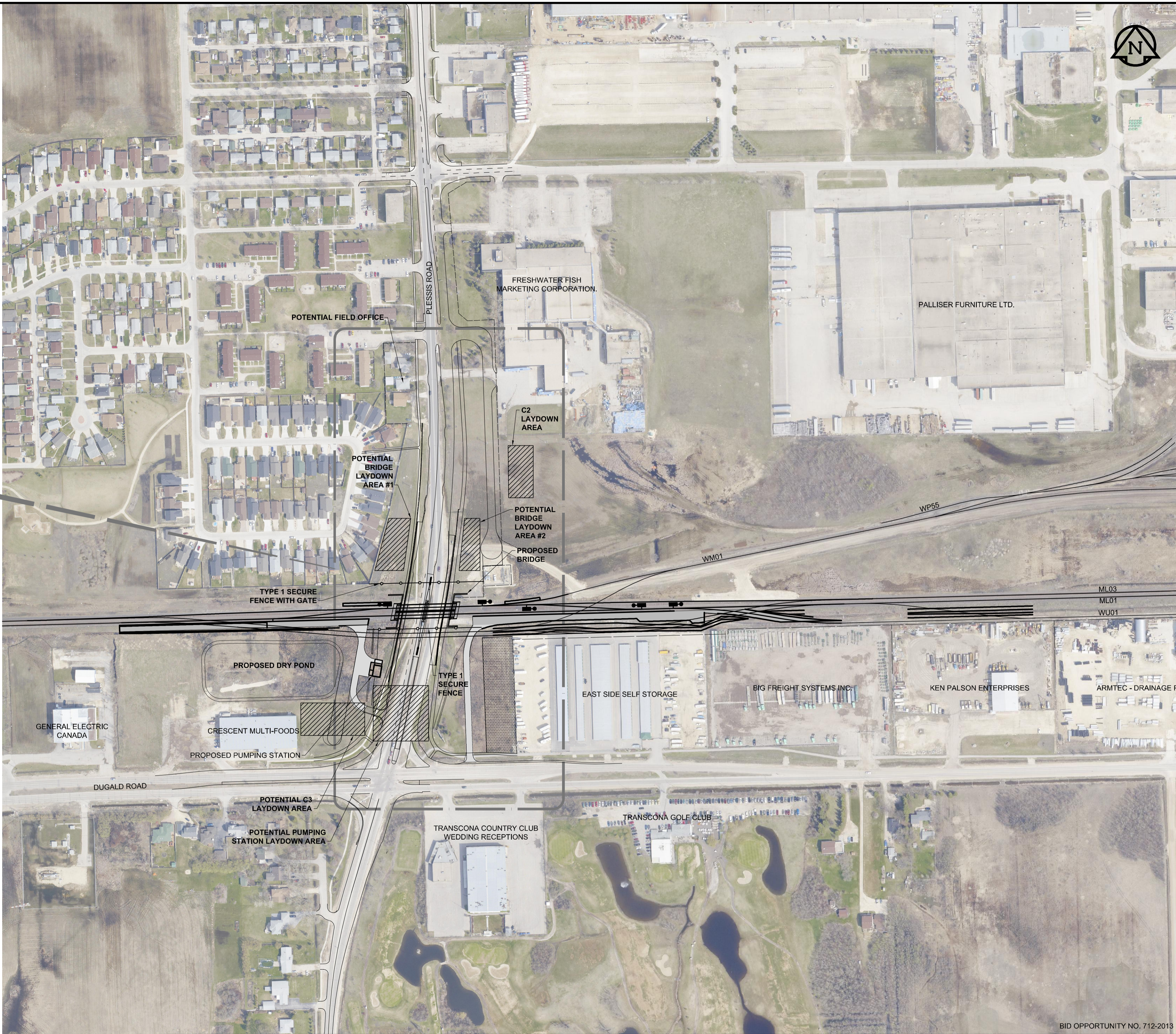
SITE PLAN Scale 1:2000