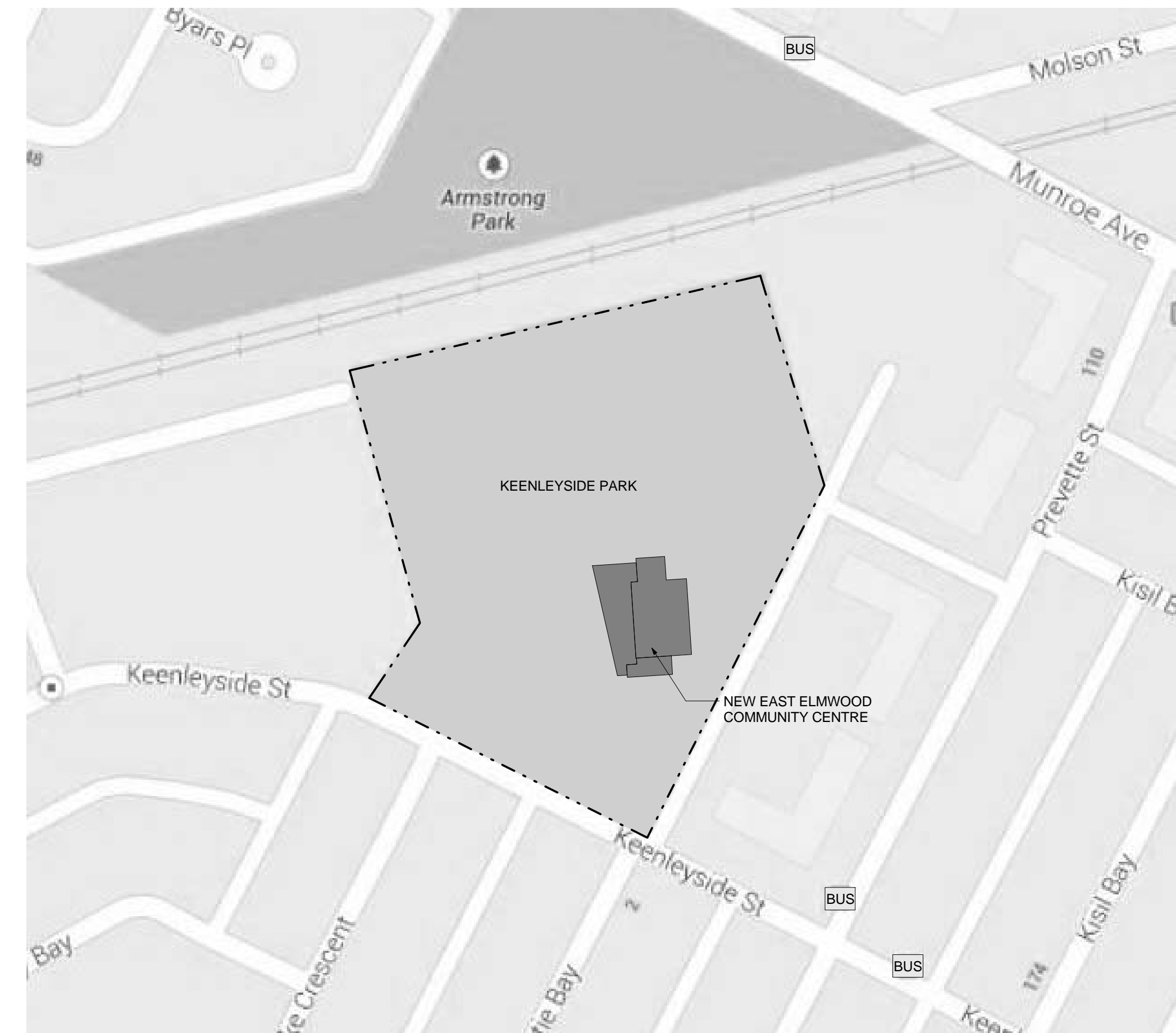
1 LOCATION MAP 1:1500