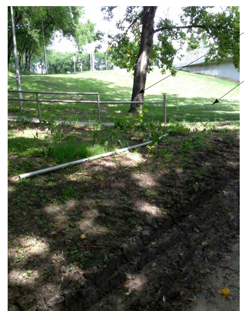
3 Existing Railing L-04

Railing sections to be repaired. Railing sections to be replaced