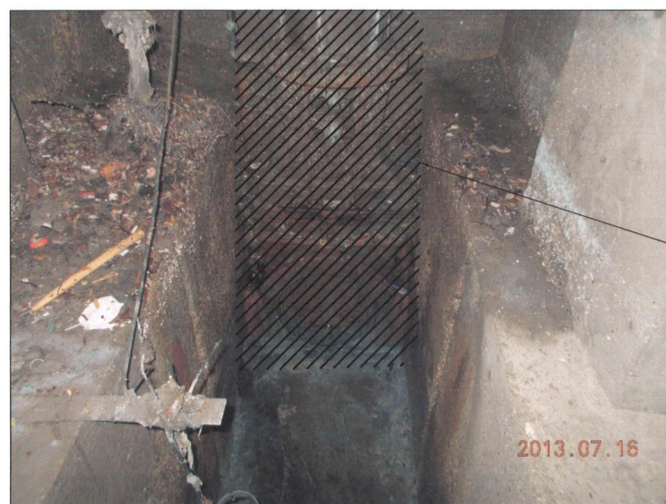
COMMINUTOR CHAMBER GATE VALVE