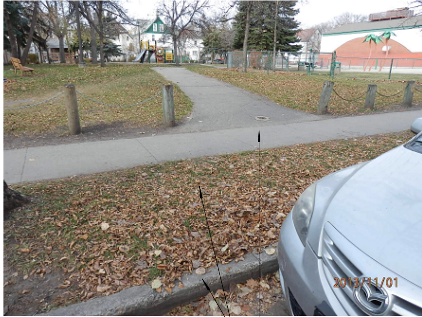
PHOTO "11": EXISTING ROAD CURB AND GRASS BOULEVARD. ENTRANCE TO THE PARK/SITE.