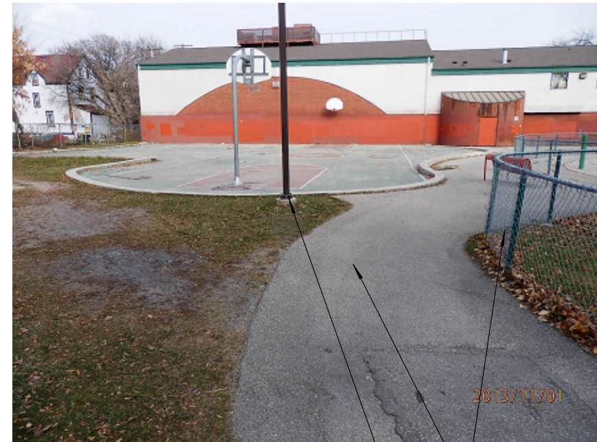
PHOTO "14": EXISTING LIGHT TO BE PROTECTED. ASPHALT WALKWAY, GRASS, AND CHAIN LINK FENCE TO BE PROTECTED.

PROJECT TITLE MAGNUS ELIASON RECREATION CENTRE BASKETBALL COURT IMPROVEMENT