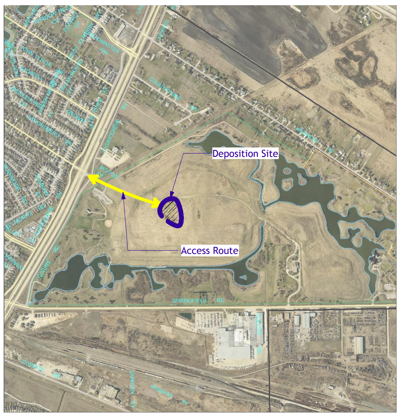
430 Scale is Approximate