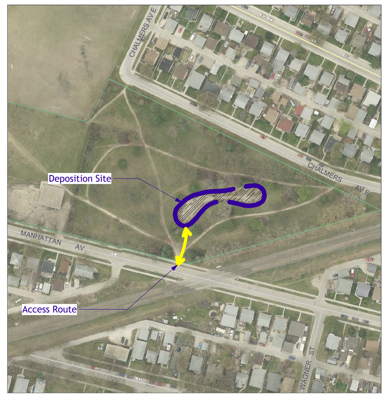
50 Scale is Approximate