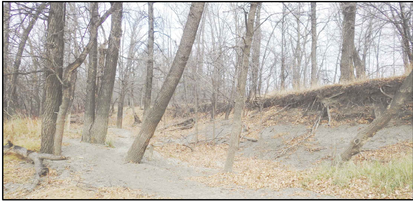
MID BANK CONDITIONS (GENERAL)