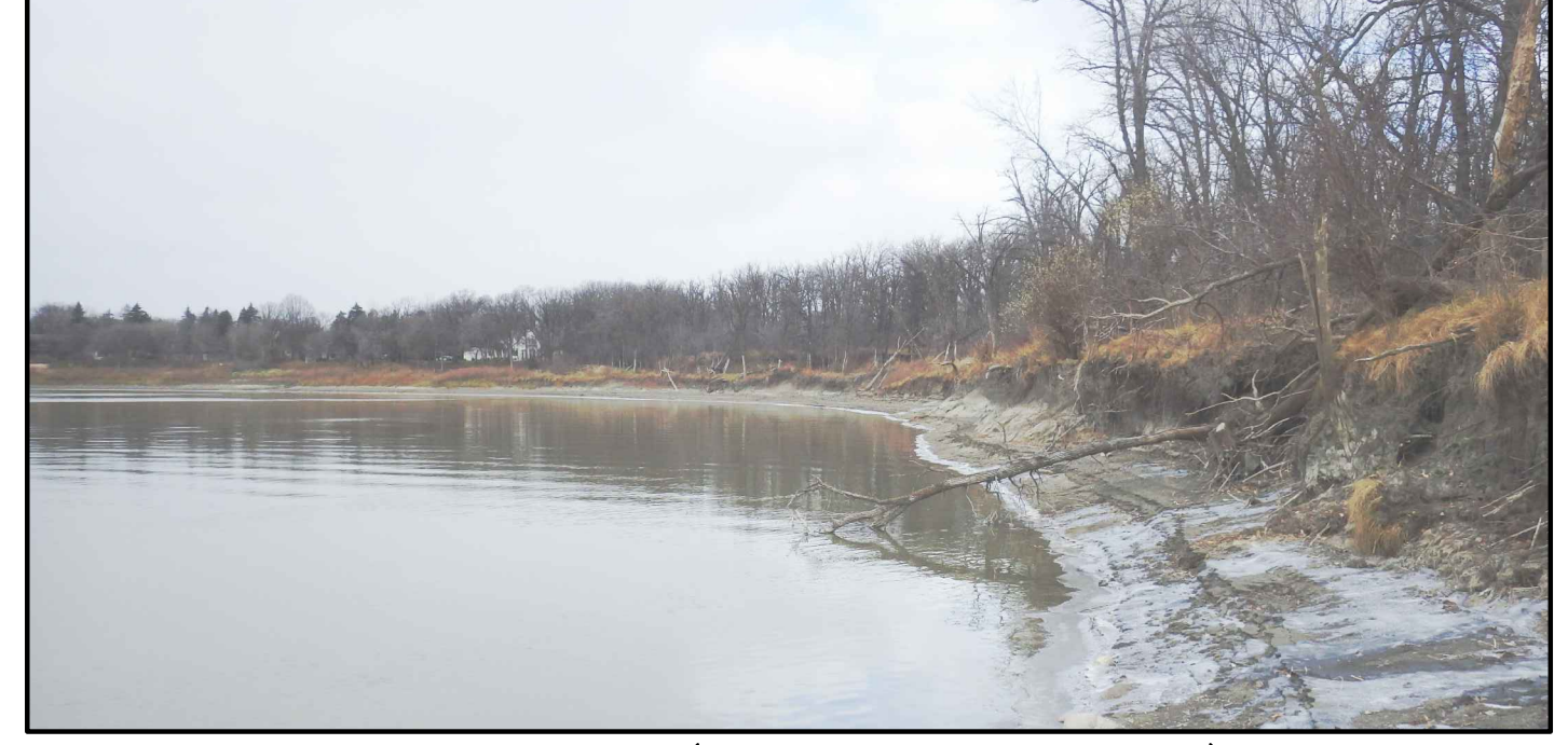
LOWER BANK (MID SITE WORK AREA)