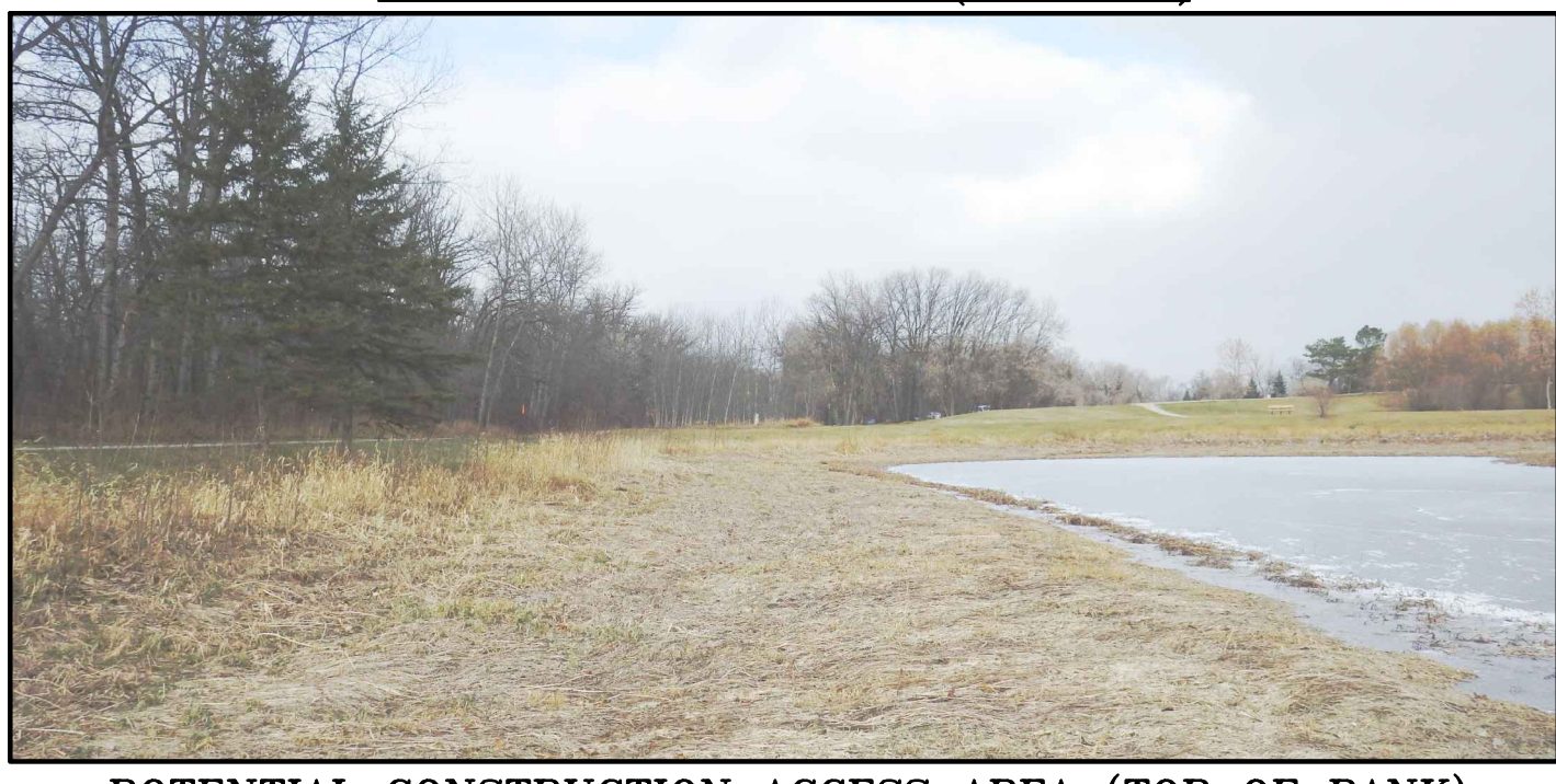
POTENTIAL CONSTRUCTION ACCESS AREA (TOP OF BANK)