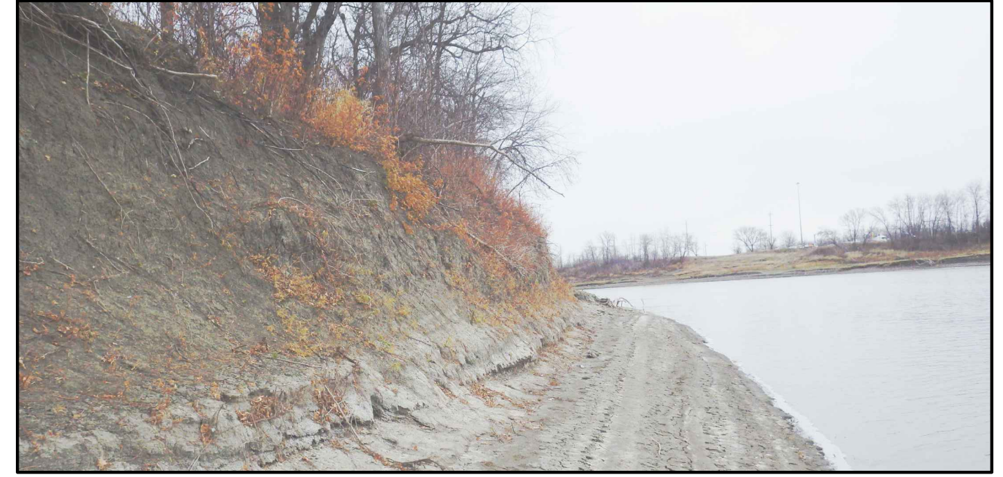
LOWER BANK (DOWNSTREAM WORK AREA)

APEGM Certificate of Authorization KGS Group No. 245