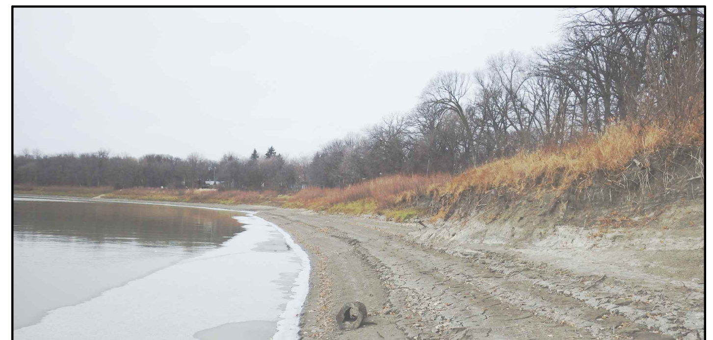
LOWER BANK (UPSTREAM WORK AREA)