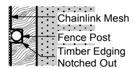
Plan of Timber Edging along Fence

* Timber measurements are to the outside of the timber edging.