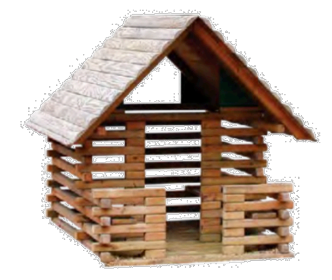
Hilde's Playhouse Model No. CP330 Best User Age: 2 to 5 Includes peaked roof, full floor, seating and front porch. Southern yellow pine construction.