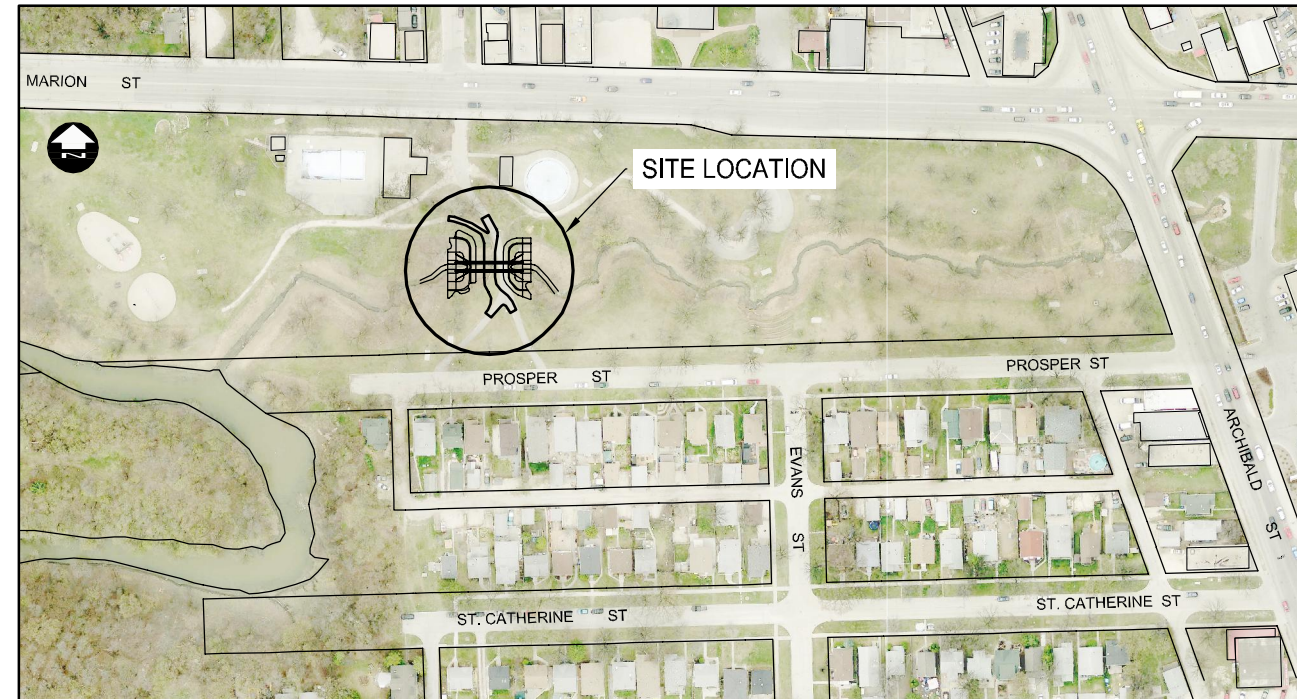
KEY PLAN NTS