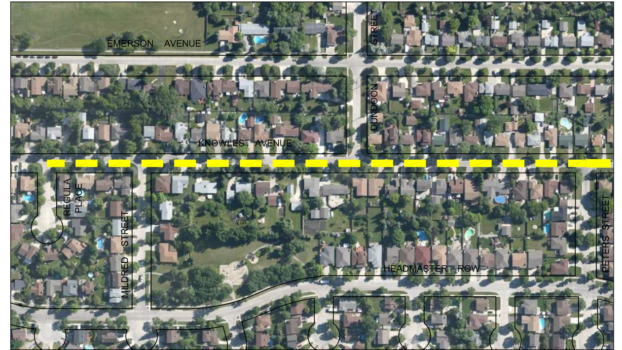
KNOWLES AVENUE - REGULA PLACE TO PETERS STREET SCALE 1:3500