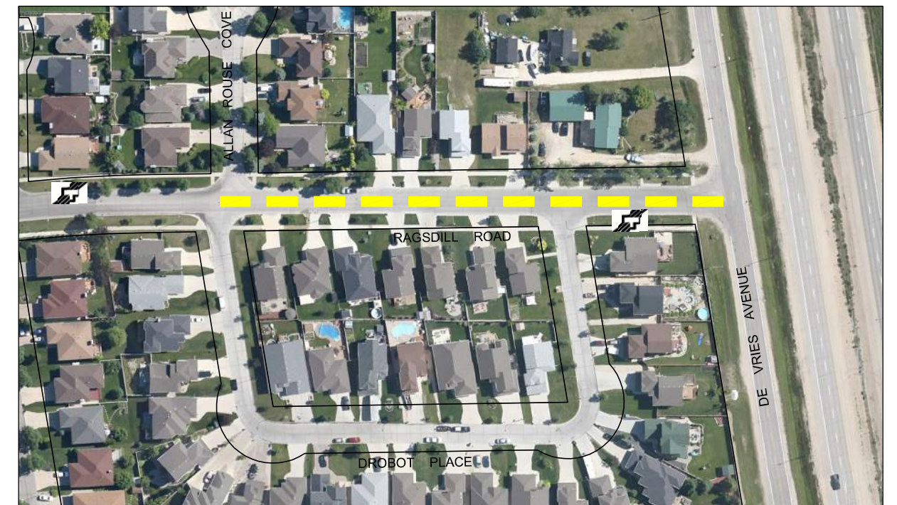
RAGSDILL ROAD - ALLAN ROUSE COVE TO DE VRIES AVENUE SCALE 1:2000