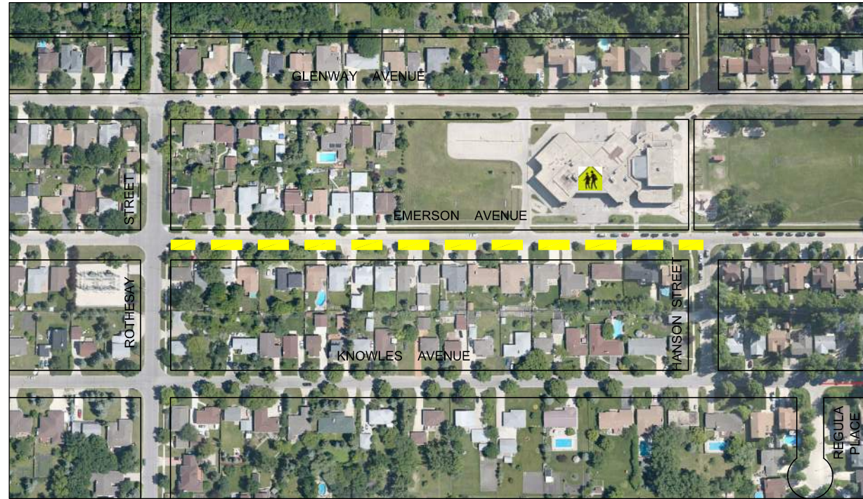
EMERSON AVENUE - ROTHESAY STREET TO HANSON STREET SCALE 1:3500

Jun 02, 2014 - 3:26pm P:\5514001-5514099\5514040 - 2014 TBO Consulting Services\MMM drawings\Contract-1\5514040-2014.01-Contract-1 Dwg-30.dwg - tab:01