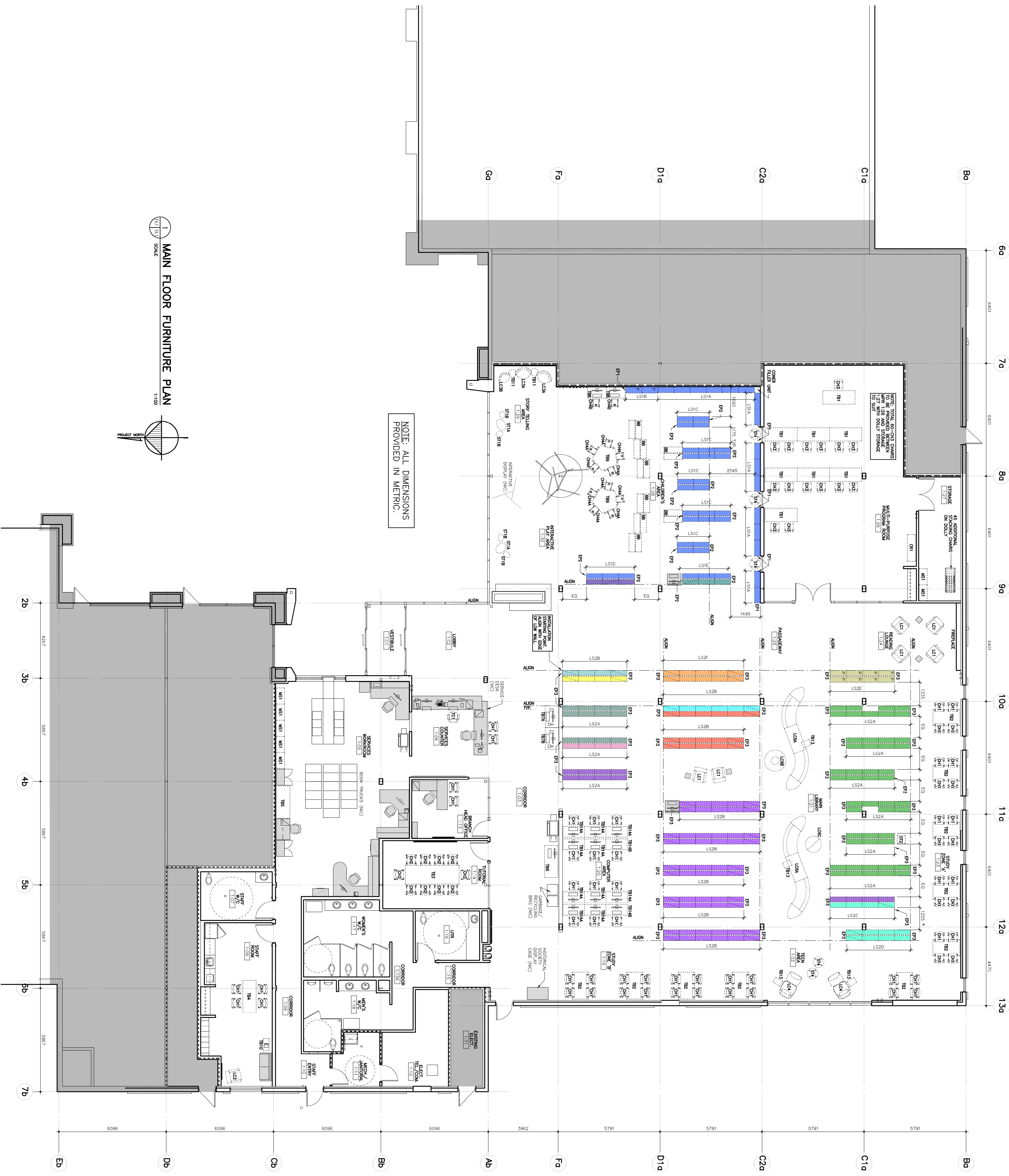
MAIN FLOOR FURNITURE PLAN SCALE 1:100