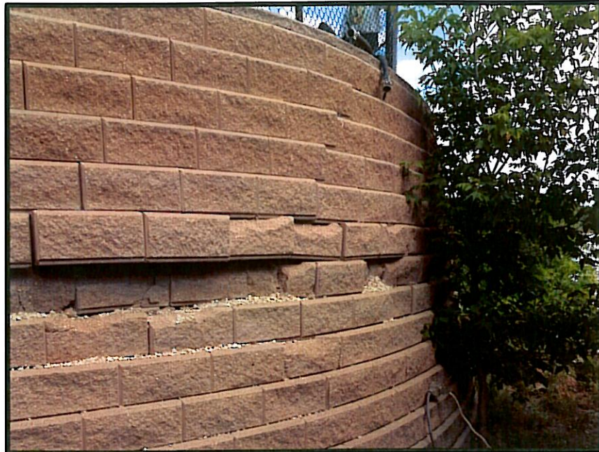
PHOTOGRAPH #1: FACING NORTH, SHOWING DAMAGED BLOCKS FROM SECTION A