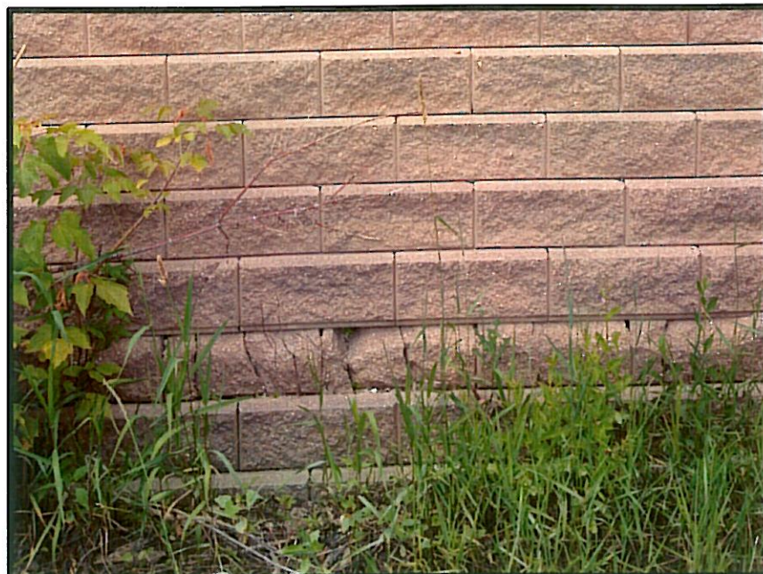
PHOTOGRAPH #4: FACING WEST, SHOWING DAMAGED BLOCKS FROM SECTION D