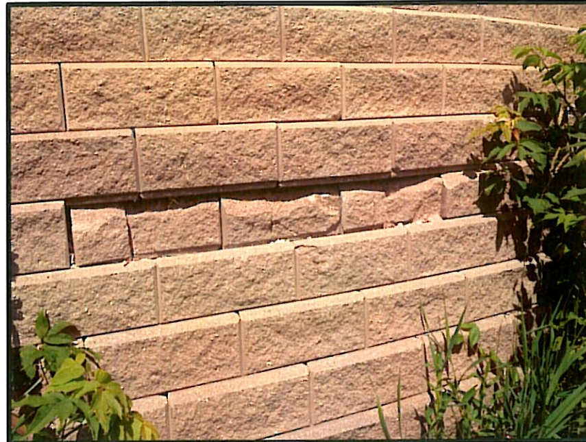
PHOTOGRAPH #2: FACING NORTHWEST, SHOWING DAMAGED BLOCKS FROM SECTION B