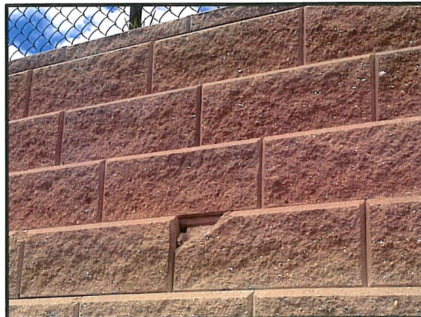
PHOTOGRAPH #5: FACING SOUTHWEST, SHOWING DAMAGED BLOCK FROM SECTION E